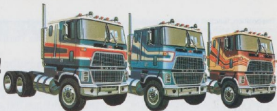
Wedge paint design Hard Fan paint design Soft Fan paint design

aluminum bumper, bright muffler and exhaust stack, dual rectangular headlights, West Coast stainless mirrors, Grover air horns (N.A. with 54" and 64" BBC), torpede roof marker lights and bright fuel cap, and bright grille.