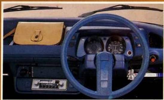
The see-at-a-glance dash controls.

On the open road, front disc brakes provide reassuring stopping power. In short, you can drive the new LNA to the limit with absolute confidence that the car won't let you down. Which means you arrive feeling refreshed and ready to tackle the jobs ahead.