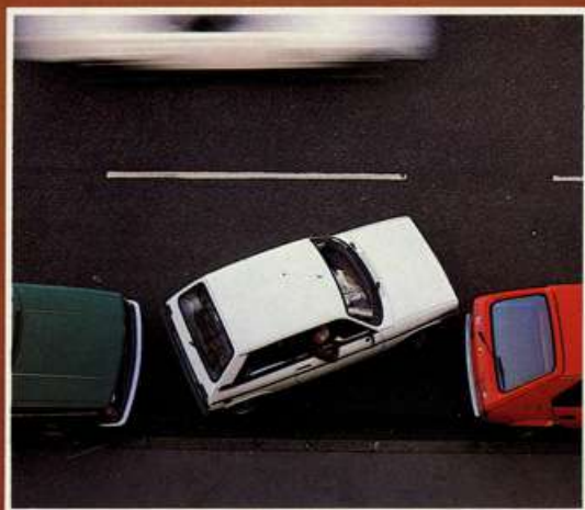
The new LNA can slot neatly into spots other drivers have to pass up.

Clocking in at just 11 feet 3 inches, with minimal overhang both front and back, this new addition to the Citroën range slots easily into the tightest of spaces. Being so compact it has a very small turning circle. And the 3.9 turns lock-to-lock mean far less effort, too.