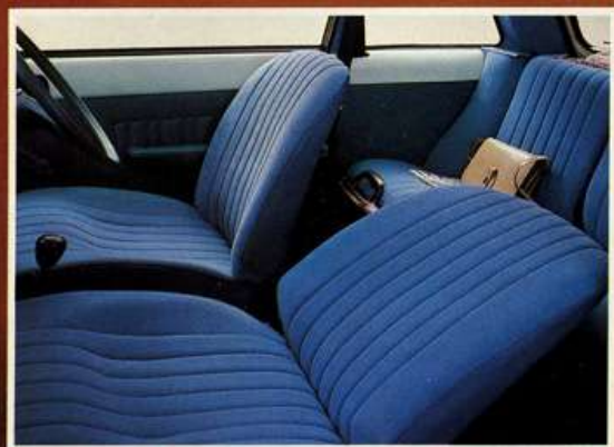
Individually reclining front seats with cloth upholstery.

Inside, there's room enough for four adults to travel in complete comfort and harmony. The cloth-covered seats are colour co-ordinated with the dashboard trim, carpets and roof lining.