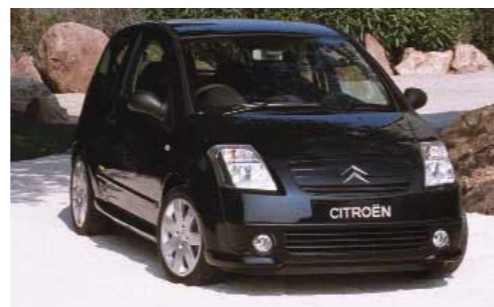
*The Manufacturer's 'On The Road' Recommended Retail Price includes the following: Delivery to Dealer and Number Plates £446.81, VAT £78.19, Government First Registration Fee £38 and Graduated Vehicle Excise Duty (see page 15 for details).