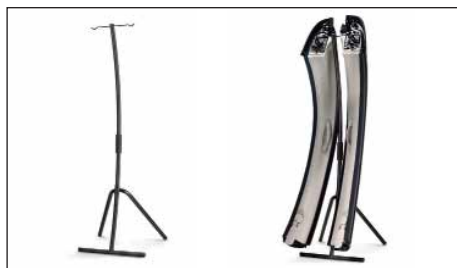
C3 Pluriel Roof Arch Storage Stand