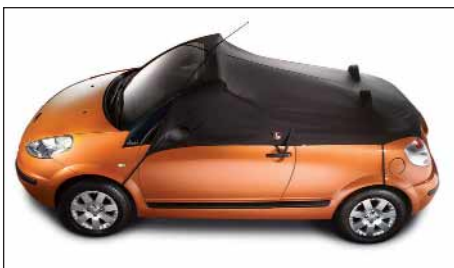
C3 Pluriel Rain Cover