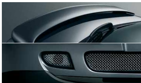
C5 VTR Sports pack