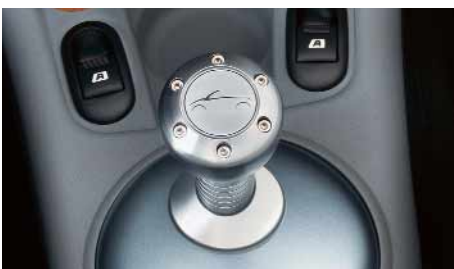
C3 Pluriel Aluminium Gear Lever