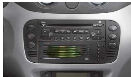
New C2/C3/C3 Pluriel 5 Disc CD Autochanger