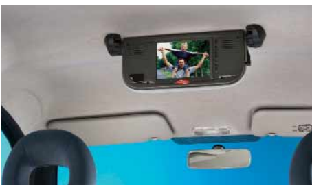
Xsara Picasso Overhead Screen