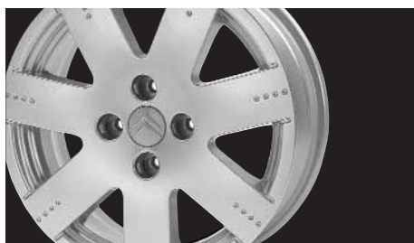
New C2/C3/C3 Pluriel 16" Leopard Alloy Wheels