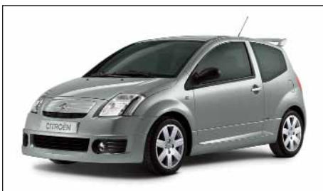
New C2 Bodystyling Kit