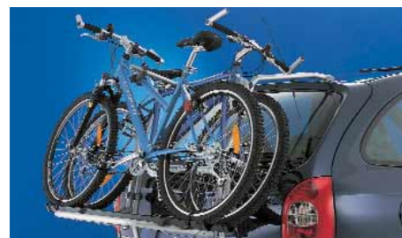
Xsara Picasso Tailgate Bike Carrier