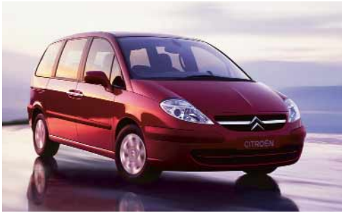
*The Manufacturer's 'On The Road' Recommended Retail Price includes the following: Delivery to Dealer and Number Plates £446.81, VAT £78.19, Government First Registration Fee £38 and Graduated Vehicle Excise Duty (see page 15 for details).