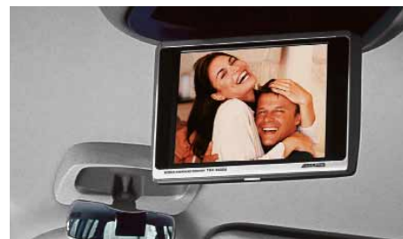
C8 Roof mounted video screen