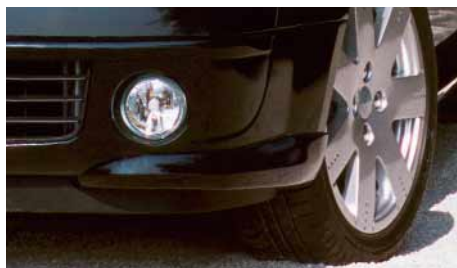
New C2 Front Fog Light Kit