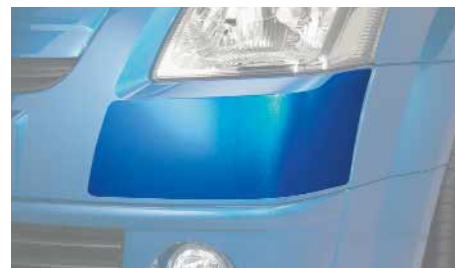
New C2/C3/C3 Pluriel Bumper Protection