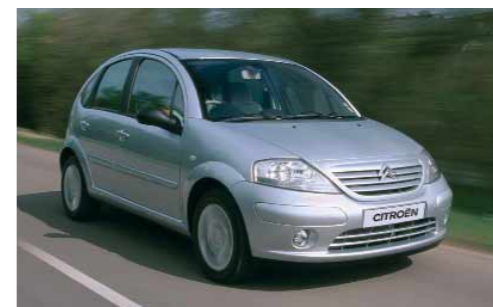
*The Manufacturer's 'On The Road' Recommended Retail Price includes the following: Delivery to Dealer and Number Plates £446.81, VAT £78.19, Government First Registration Fee £38 and Graduated Vehicle Excise Duty (see page 15 for details).