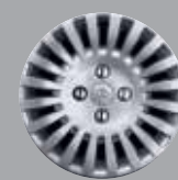
'Lynx' 15" alloy wheels Exclusive