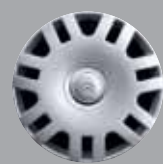
'Milan' 14" steel wheels L / SX Petrol only