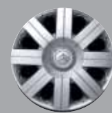
'Pelican' 15" steel wheels Stop & Start