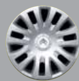
'Condor' 14" steel wheels Desire