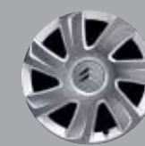
'Cheetah' 16" alloy wheels