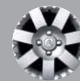
'Coyote' 15" alloy wheels XTR