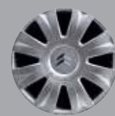
'Inca' 15" steel wheels SX Diesel only