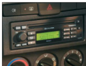
Stereo RDS Radio/CD Player