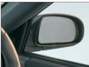
Electric Door Mirrors