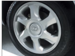
15" Alloy Wheel

15" alloy wheels together with an engine immobiliser, electric door mirrors, stereo RDS Radio/CD player and central locking will further enhance your driving pleasure.