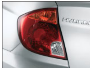
Rear Light Cluster