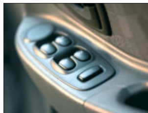
Electric Window Controls