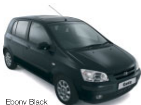
Ebony Black (Solid)

A metallic finish is achieved by adding aluminium flakes to the paint and then applying a coat of clear lacquer.