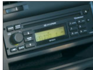
Stereo RDS Radio/CD Player

Hyundai Getz: No space too small, no journey too long.