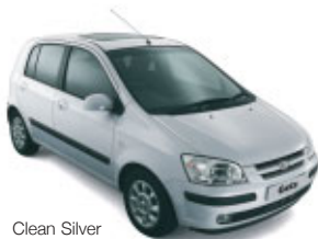
Clean Silver (Metallic)