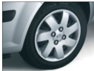
14" Steel Wheel