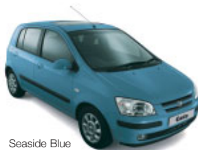
Seaside Blue (Metallic)