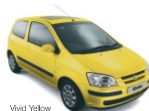
Vivid Yellow (Solid) 1.6 Sport only