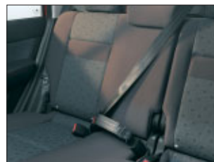
3 x 3 Point Rear Seatbelt