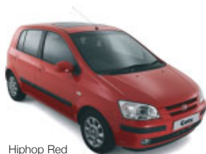
Hiphop Red (Solid)