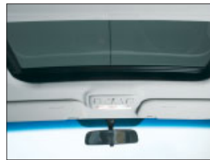
Electric Tilt and Slide Sunroof