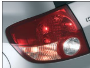
Rear Light Cluster