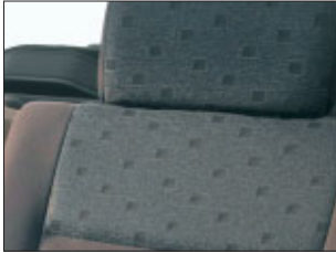
Cloth Upholstery on CDX

When you get inside the Getz, it really holds its own. Surrounded by a host of extras to enhance your driving pleasure, the ride, performance and comfort will put a renewed sparkle into your life.