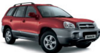
Cerise Red (Mica)

The final outward appearance is down to your personal choice. Solid, metallic and mica options are available.