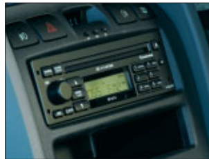
Stereo RDS Radio/CD Player