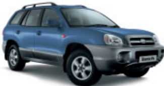
Breezy Blue (Metallic)