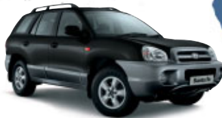
Ebony Black (Solid)

We have designed the Santa Fe to look good anywhere at anytime.