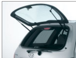
Flip Up Rear Tailgate Window