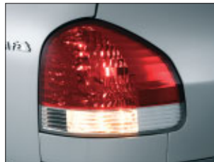
Rear Light Cluster