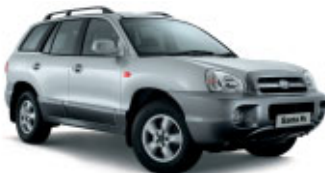
Smart Silver (Metallic)