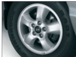
16" Alloy Wheel