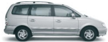
Warm Silver (Metallic)