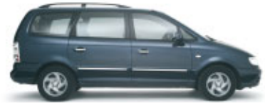
Dark Blue (Metallic)