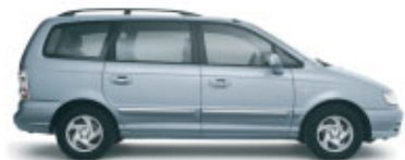
Glacier Silver (Mica)