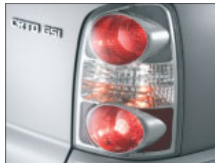
Rear Light Cluster