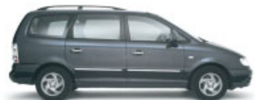
Storm Grey (Metallic)