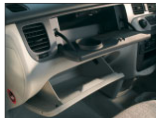
Twin Glove Compartment