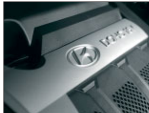
2.0 GSI CWVT Engine

Hyundai have also developed a range of complementary accessories to enhance your driving experience. Please consult your Hyundai dealer for further information.