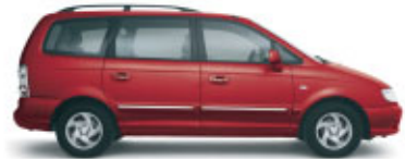
Poppy Red (Solid)