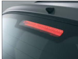
High Mounted Brake Light

The Trajet is a great family car from a family of great cars. From the body coloured bumpers and door mirrors to the practical roof rails, this vehicle is big on style, and it all comes as standard.