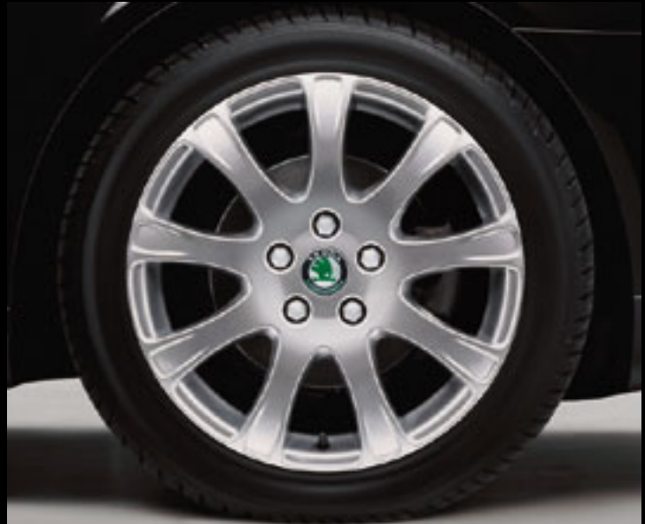
17" Sputnik light alloy wheels in silver, the exclusive Edition 100 colour.

A hundred years of automobile manufacture represents a hundred years of experience from which the Škoda Octavia Edition 100 also benefits. This is immediately apparent when we take a look at the equipment. The perfect workmanship of the interior, high-quality leather seats offering ample seating comfort, gear changes that are not only precise but even the gear stick looks good, are just a few examples. The same applies to the 17" Sputnik silver-coloured alloy wheels exclusive to the Edition 100.