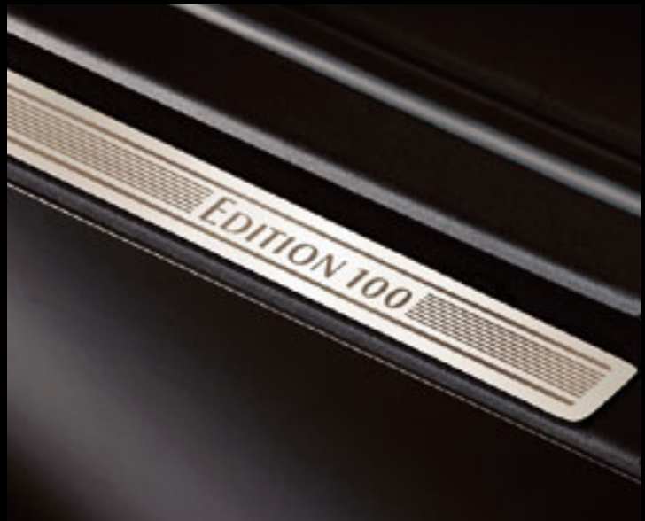
Decorative door sill covers with stainless steel inserts on the Edition 100.

The highest quality standards have also been applied to the sound system, which features no less than 12 speakers to turn the interior into a concert hall. And then a range of extras, unimaginable a hundred years ago, from the automatic parking assistant with front and rear parking sensors to the polished exhaust pipe end piece and Xenon headlights. However, the greatest progress lurks under the bonnet. To appreciate this to the fullest, we recommend a test drive.