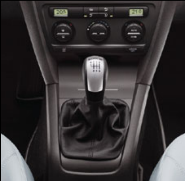
Edition 100 gear stick.