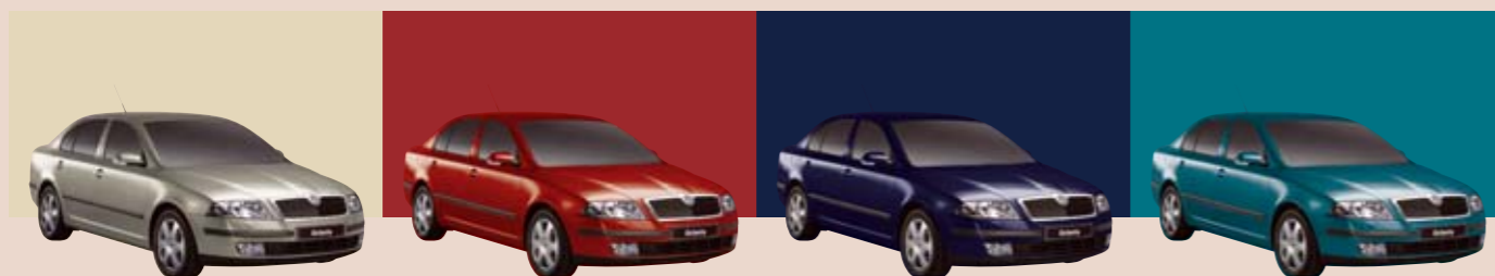
Sahara metallic Q2Q2