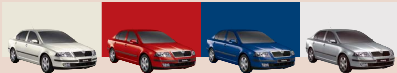
Candy White 9P9P