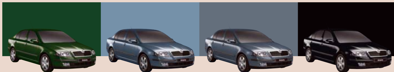
Nature Green metallic 3Y3Y*