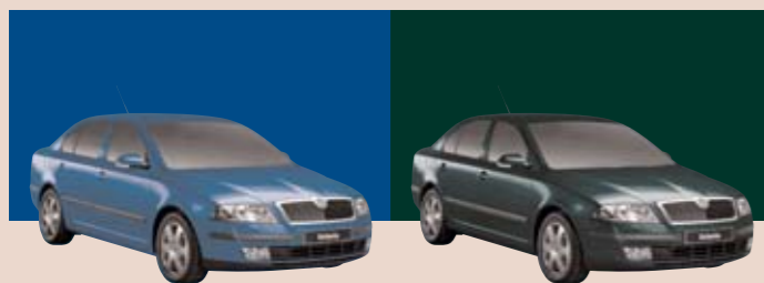
Blue Storm metallic 8D8D**