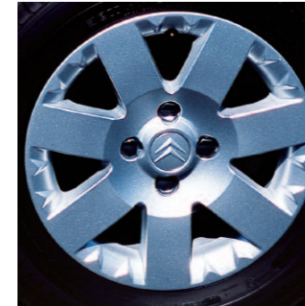
15" Alloy wheels with broad 185/65 R15 tyres combine style and safety