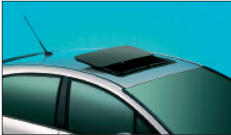
New C4 Electric Sunroof