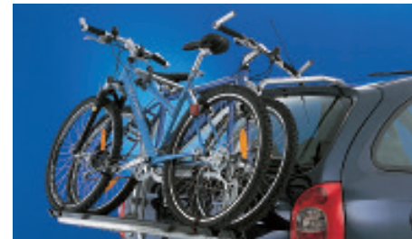
Xsara Picasso Tailgate Bike Carrier