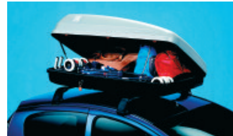
New C1 Roof Box - Short, 280 L capacity (available on all models)