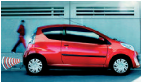
New C1 Parking Sensor Kit - Front & Rear