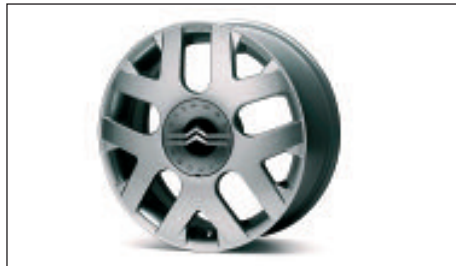
New C4 'San Marcos' 17" Alloy Wheel