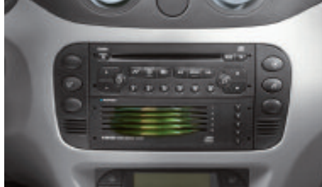
C2/C3/C3 Pluriel 5 Disc CD Autochanger