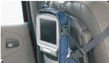
C8 Portable DVD player (available on all models)