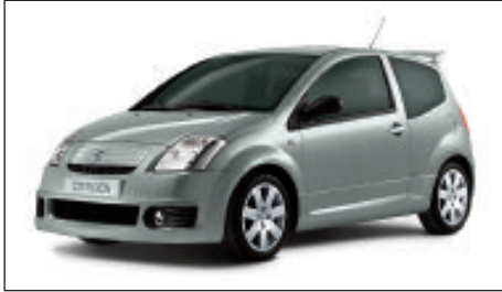
C2 Bodystyling Kit