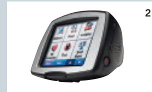
1 Five Disc CD Changer