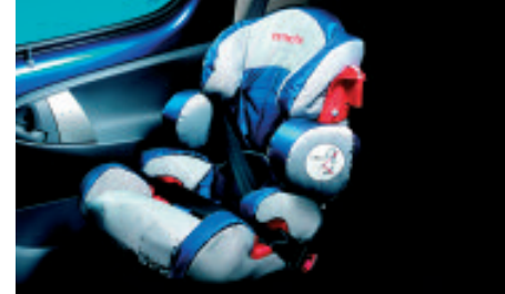
New C1 'Kiddy Life' Baby Seat (available on all models)