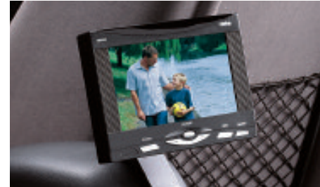
New C4 Multimedia Pack