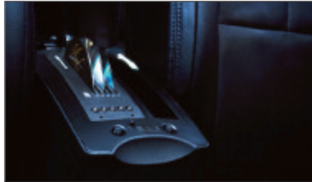
New C4 5 Disc CD changer in armrest