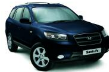
Blue Onyx (Mica)