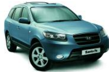
Blue Titanium (Metallic) ▼