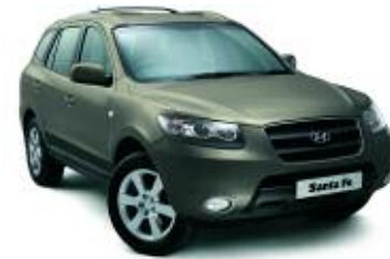
Natural Khaki (Metallic) ▼