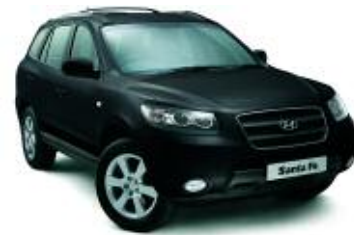
Black Pearl (Mica)