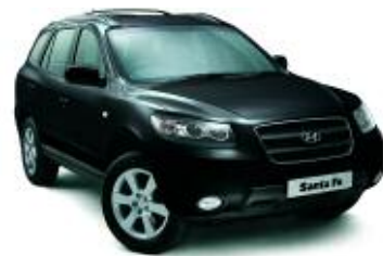
Ebony Black (Solid)

The Santa Fe is a car to be seen in and will turn heads as well as it turns corners.