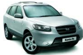
Platinum Silver (Metallic)