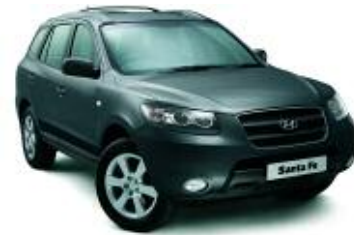
Gun Metal (Metallic)