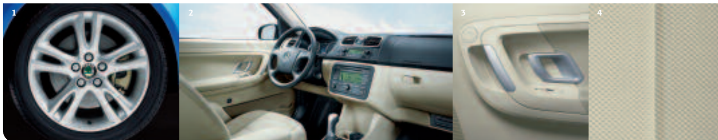
4 Ivory Cloth Upholstery