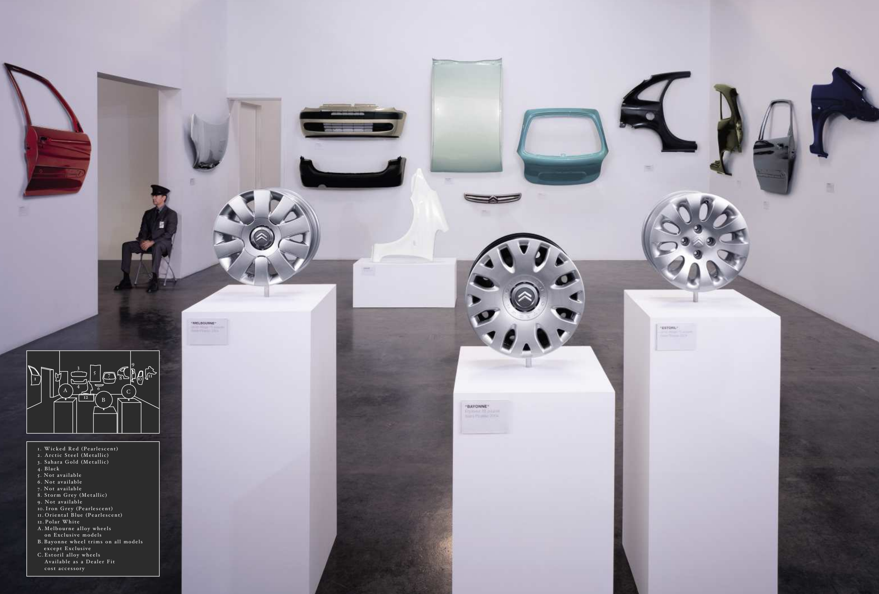
"MELBOURNE" Alloy Wheel - Exclusive Dealer Fit only 2014