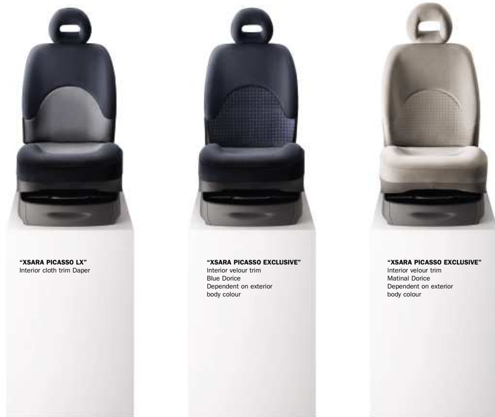
"XSARA PICASSO LX" Interior cloth trim Daper