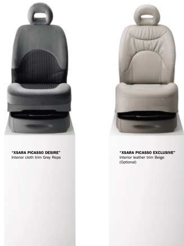
"XSARA PICASSO DESIRE" Interior cloth trim Grey Repts