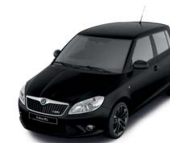
Black Magic pearl effect