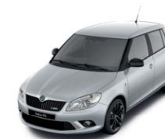
Brilliant Silver metallic