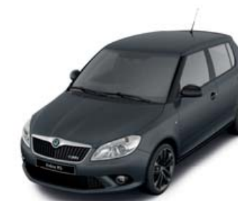
Anthracite Grey metallic