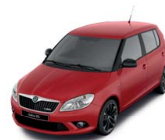
Corrida Red uni