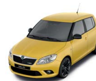
Sprint Yellow special