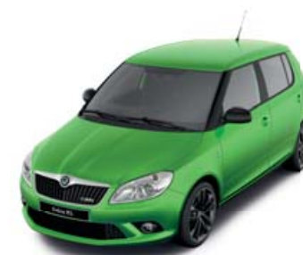
Rallye Green metallic