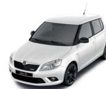
Candy White uni