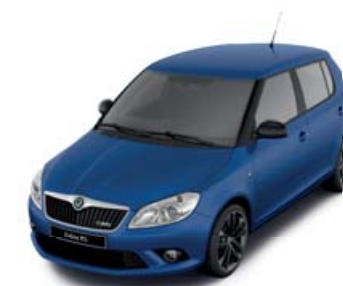
Race Blue metallic