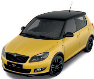
Sprint Yellow F2F2