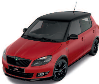
Corrida Red 8T8T