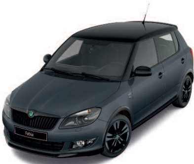
Anthracite Grey metallic 9J9J