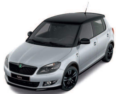
Brilliant Silver metallic 8E8E

Because of errors which may occur in the print, the colours illustrated here may differ from the actual finishes themselves. Your Škoda retailer will be pleased to advise you. Please see your local retailer for samples.