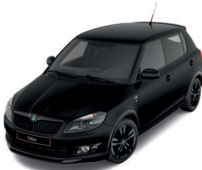
Black Magic Pearl Effect 1Z1Z