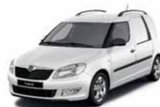
Candy White uni

The listed services represent only a part of the wide range of ŠKODA service offers, which may vary from country to country. Please contact your authorised ŠKODA service partner for further details and information on the range and specific conditions of services they offer.