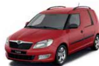
Corrida Red uni