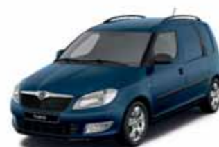
Pacific Blue uni