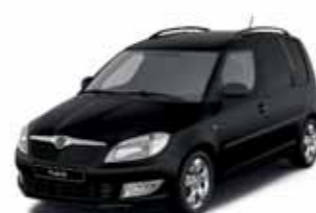
Black Magic pearl effect