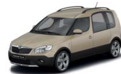
ŠKODA Roomster Scout