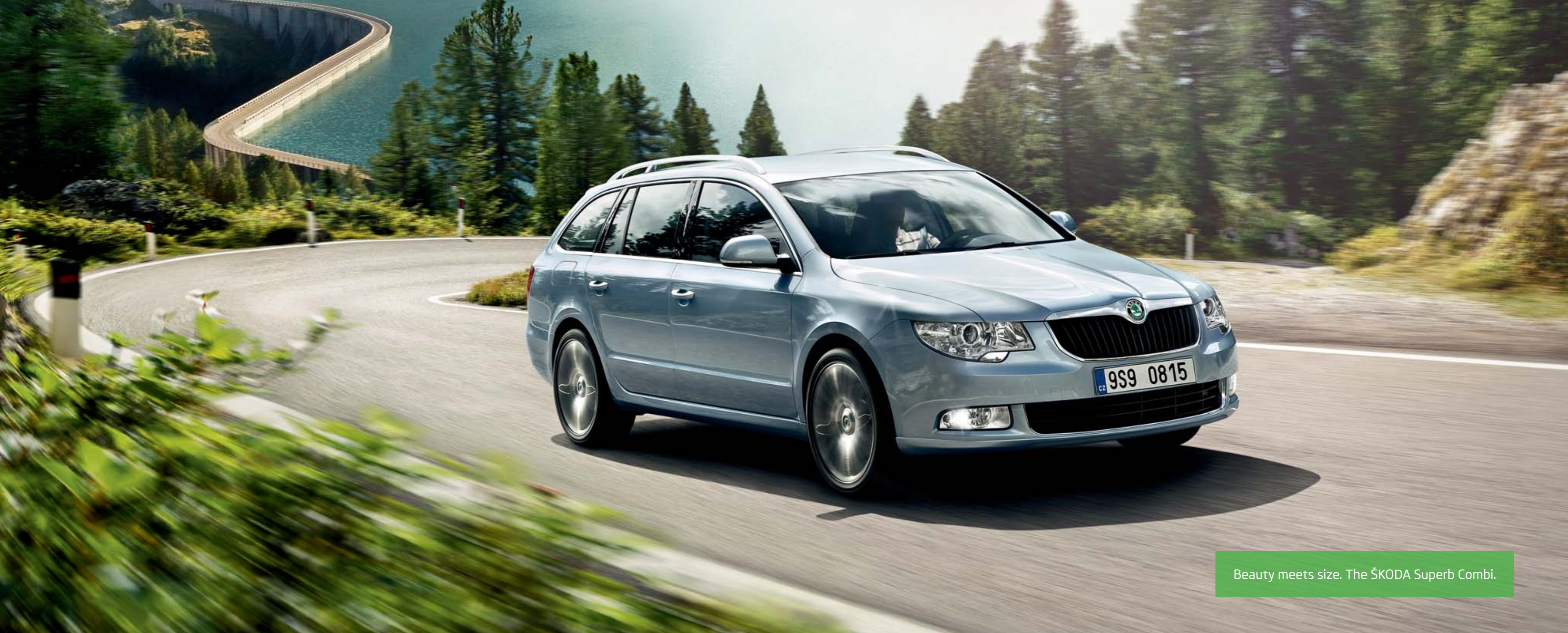
Beauty meets size. The ŠKODA Superb Combi.