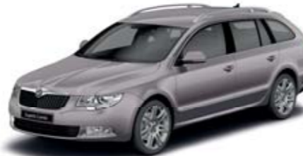
ŠKODA Superb Combi