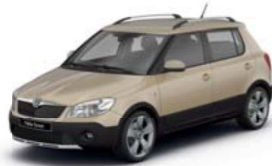
ŠKODA Fabia Scout