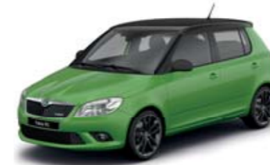
ŠKODA Fabia RS