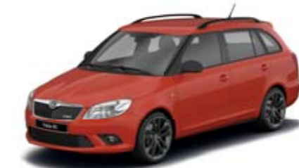
ŠKODA Fabia Combi RS