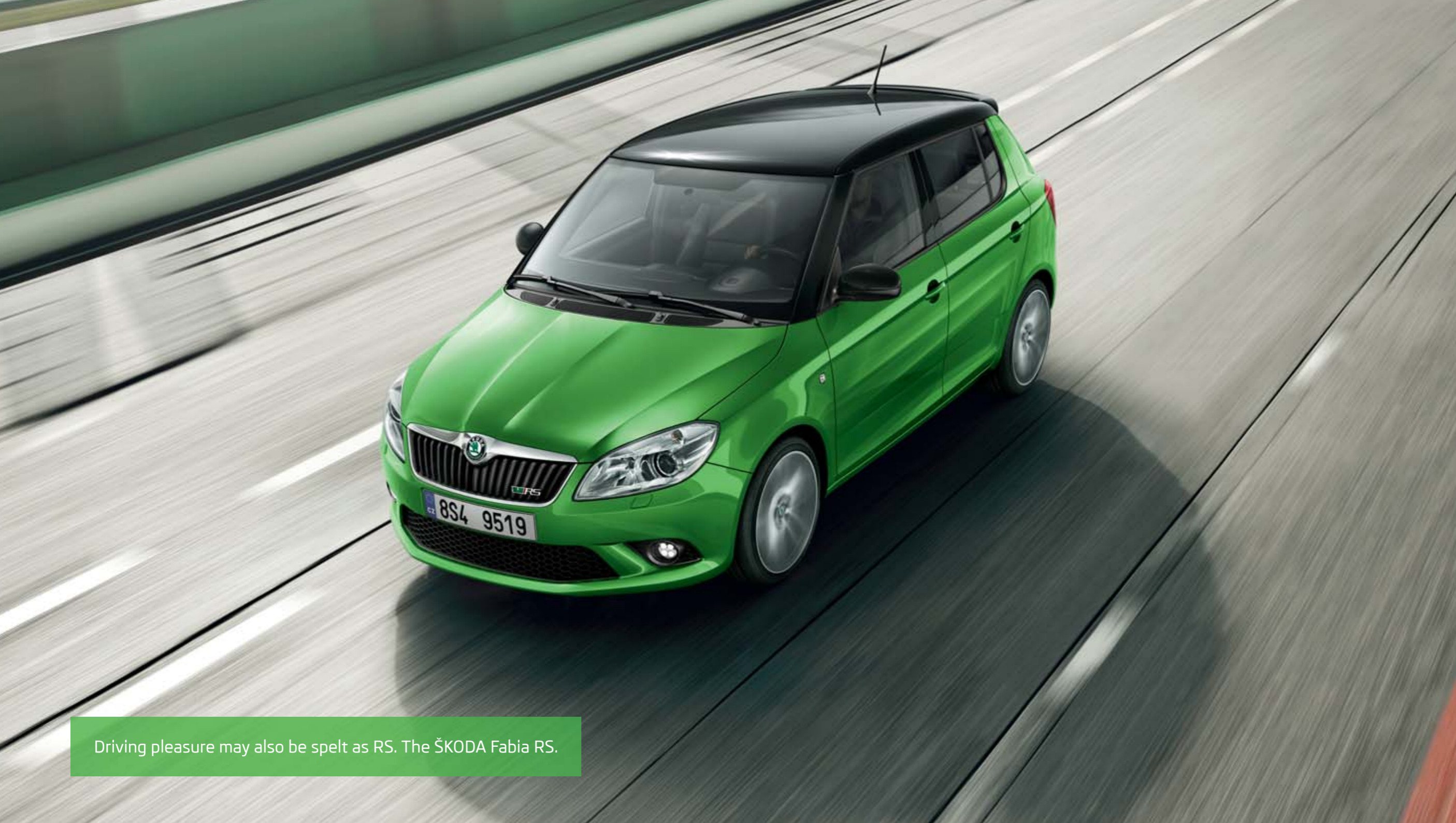
Driving pleasure may also be spelt as RS. The ŠKODA Fabia RS.