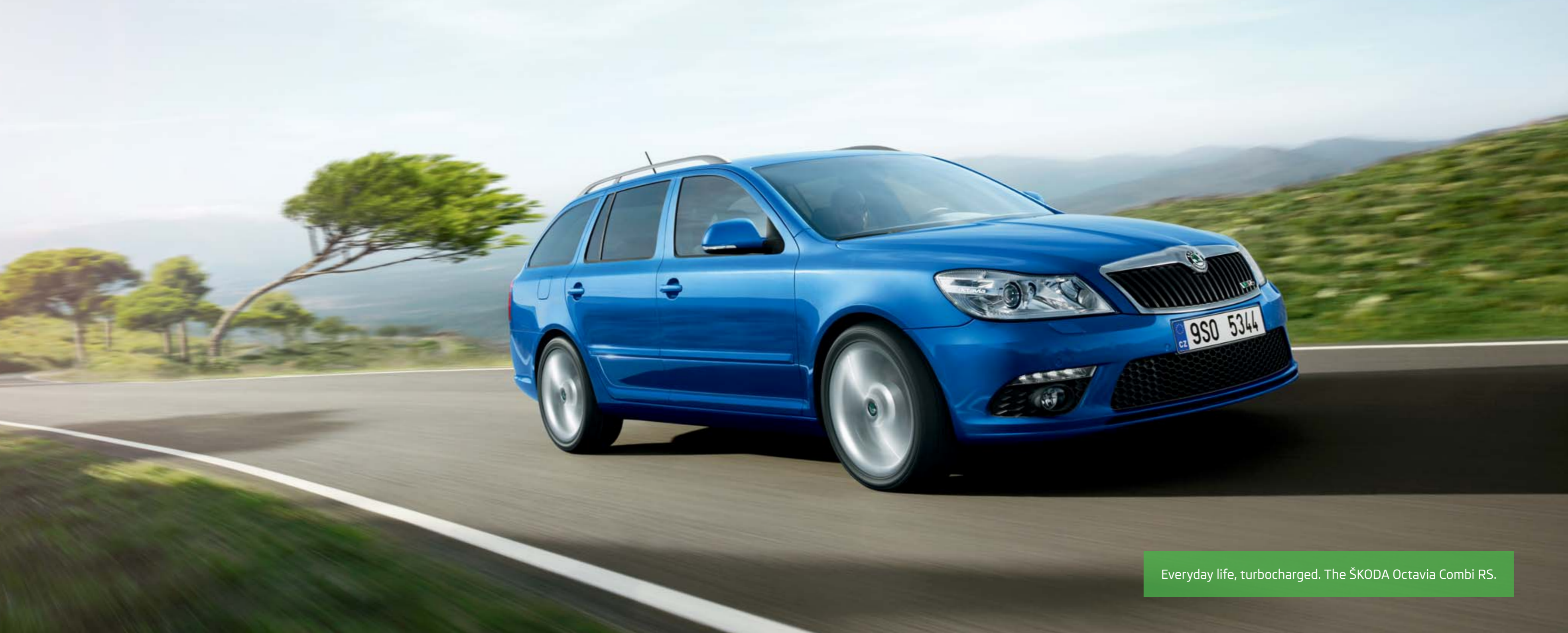
Everyday life, turbocharged. The ŠKODA Octavia Combi RS.