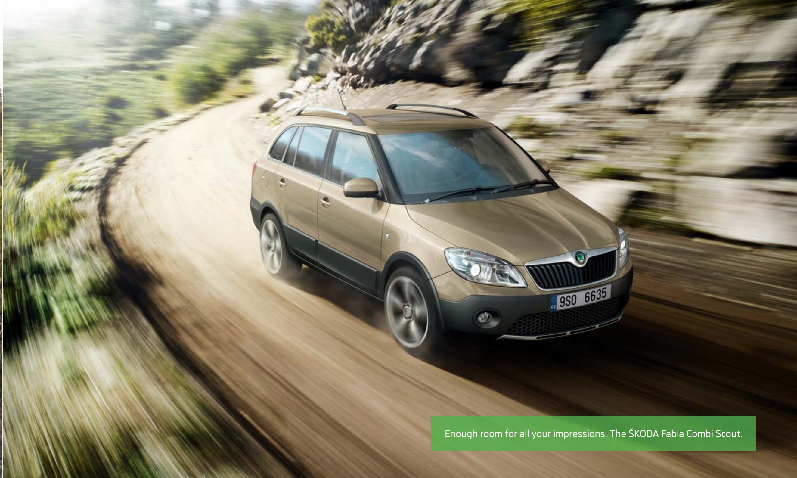
Enough room for all your impressions. The ŠKODA Fabia Combi Scout.