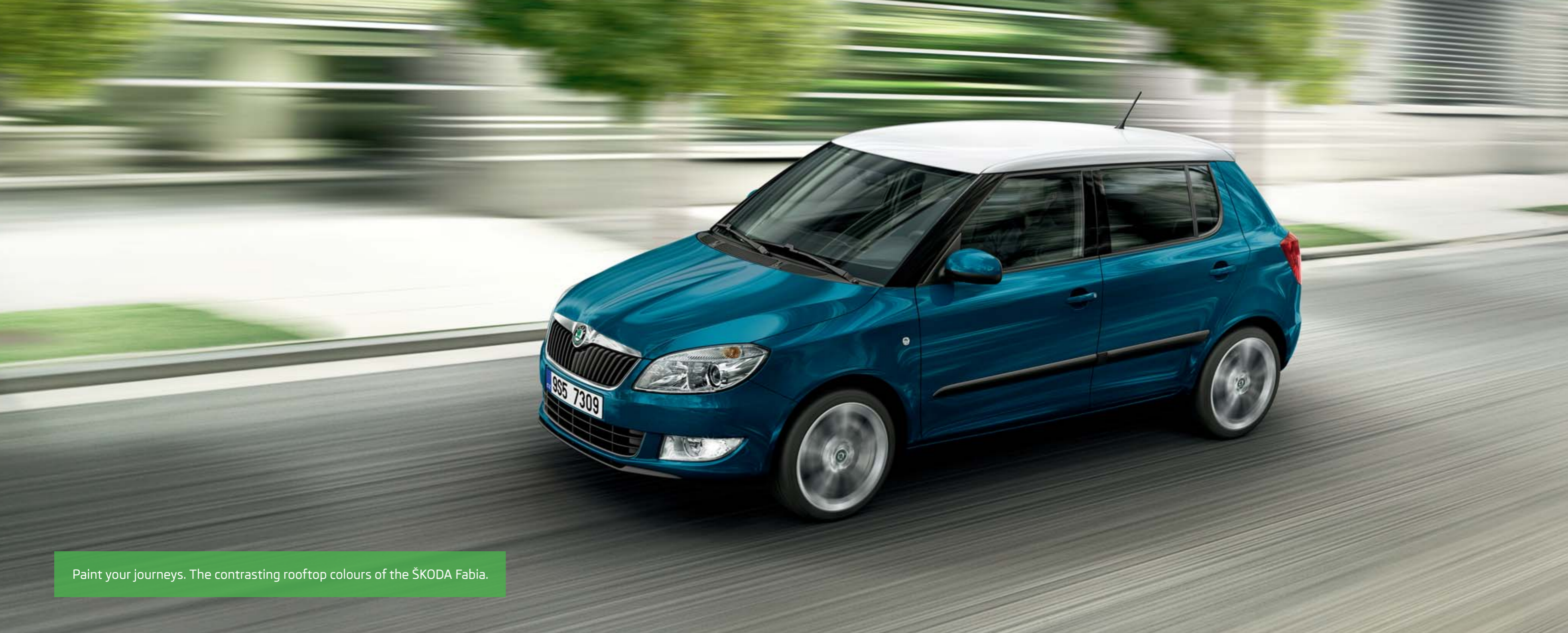
Paint your journeys. The contrasting rooftop colours of the ŠKODA Fabia.