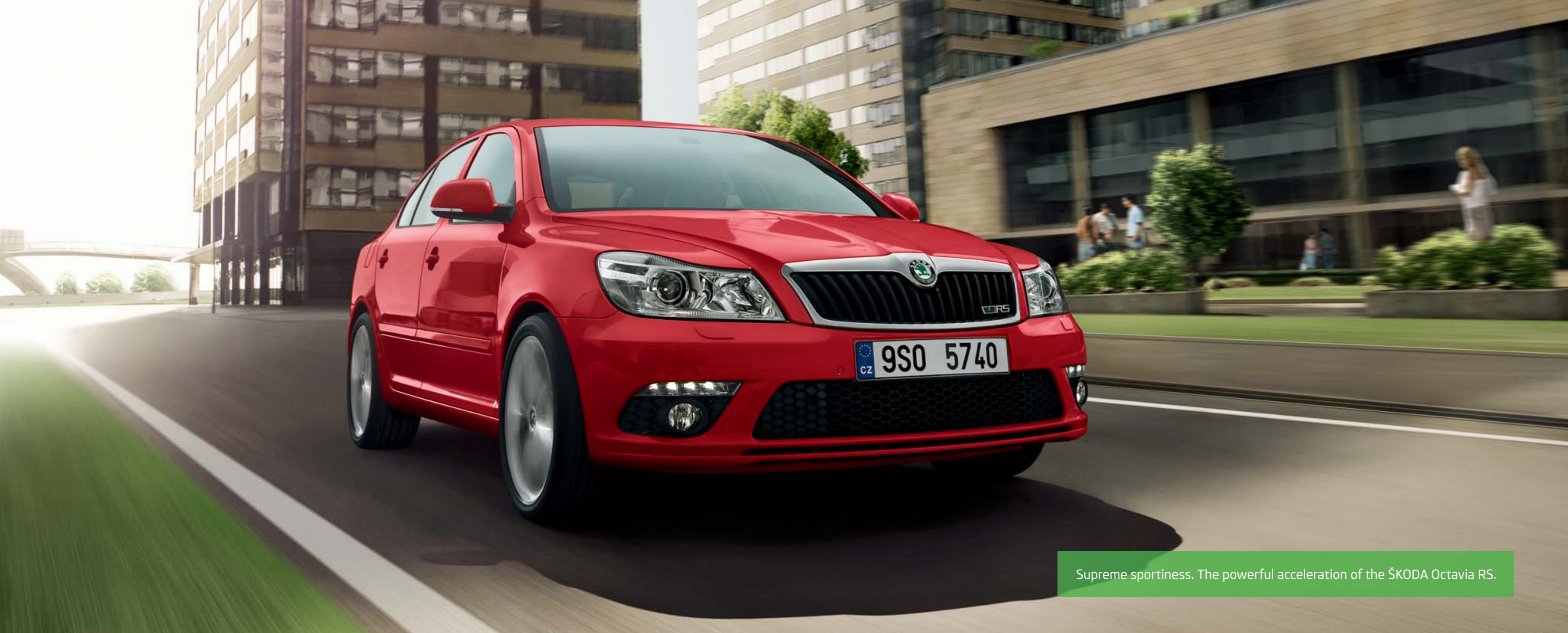
Supreme sportiness. The powerful acceleration of the ŠKODA Octavia RS.