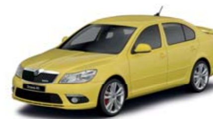
ŠKODA Octavia RS