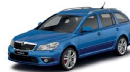
ŠKODA Octavia Combi RS