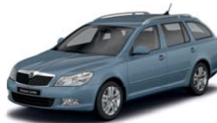
ŠKODA Octavia Combi