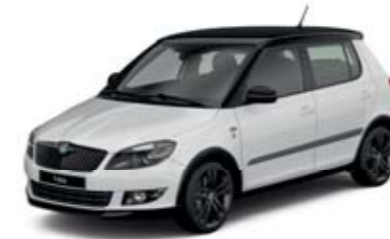
ŠKODA Fabia Monte Carlo