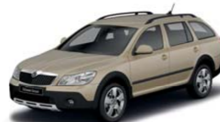
ŠKODA Octavia Scout