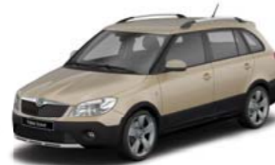
ŠKODA Fabia Combi Scout