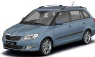
ŠKODA Fabia Combi