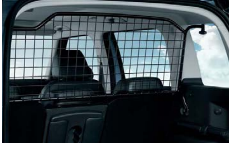
Trunk grille (DMM 630 001)