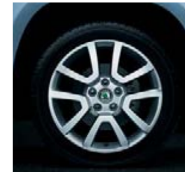
Alloy wheel 7.0J x 17" Spitzberg for tyre 225/50 R17 (CCH 630 003)