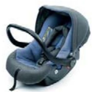
ISOFIX G 0/1 child seat (5LO 019 905) with RWF frame for rear-facing fitting (5LO 019 902A)