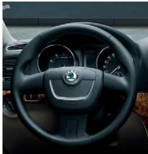
Leather steering wheel; 3-spoke (FBA 800 001) No photo: 4-spoke (FBA 800 000)