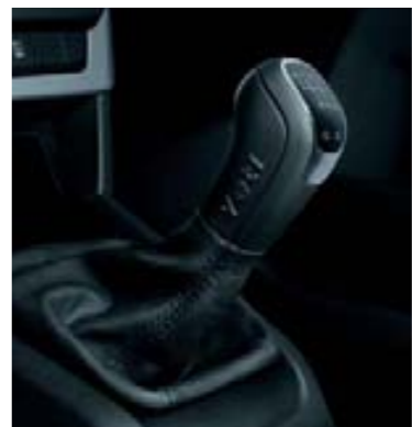
Leather gear stick knob with Yeti writing; 4x4 6-speed manual transmission (5L0 064 230E) No photo: 5-speed manual transmission (5L0 064 230C); 6-speed manual transmission (5L0 064 230D) Leather gear stick sleeve (5L1 071 350)