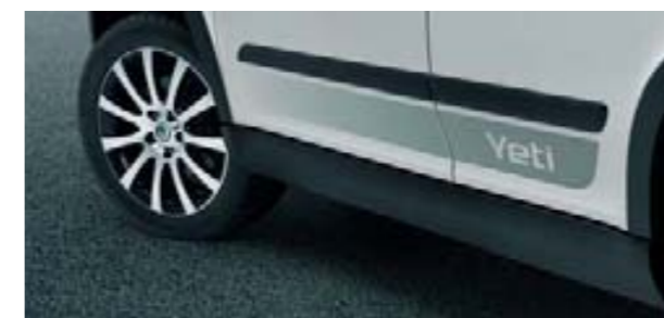
Side door foil; dark version (5LO 071 733A)