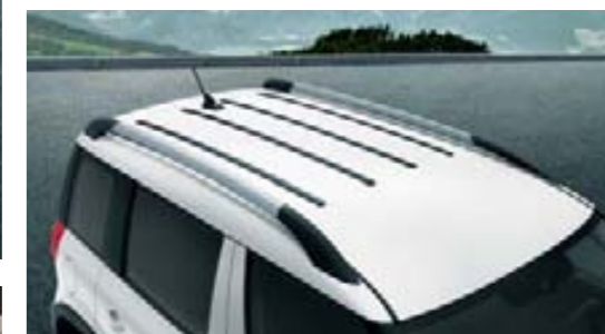
Roof strips (5LO 071 326)