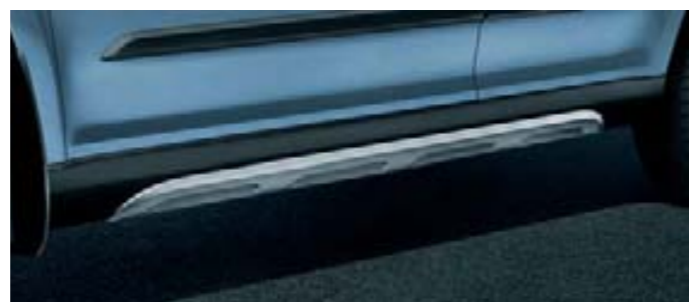
Side sill covers; ALU look (FAA 630 002)