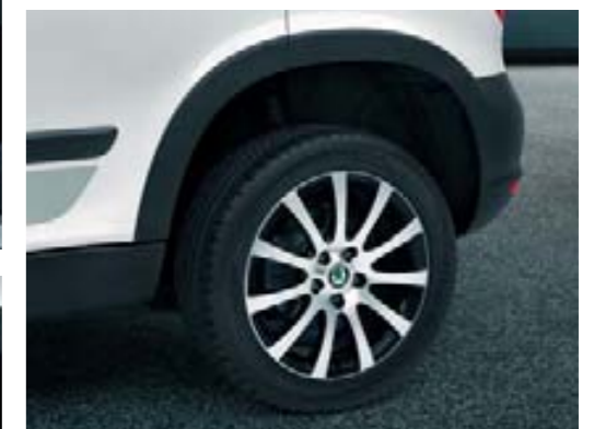
Alloy wheel 7.0J x 17" Annapurna; silver/black design to stress the off-road character; for tyre 225/50 R17 (CCH 630 005) Wheel arch extensions; 8-piece set for both front and rear arches (5LO 071 069)

The characteristic functional design of the Yeti can be made even more attractive by adding features from the sport & design category. In the same way you can highlight the off-road style of the vehicle, both inside and out.