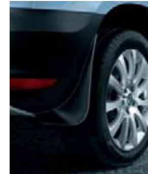
Rear mud flaps (KEA 630 002)