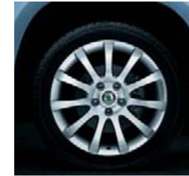
Alloy wheel 7.0J x 17" Annapurna for tyre 225/50 R17 (CCH 630 004)