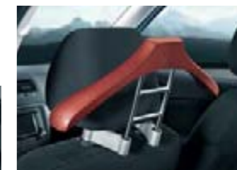
Clothes hanger (3T0 061 127)