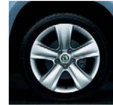
Alloy wheel 7.0J x 17" Dolomite for tyre 225/50 R17 (CCH 630 002)