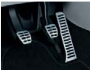
Stainless steel foot pedal covers; 3-piece set (5L1 064 200) No photo: 2-piece set for automatic transmission (5L1 064 205)