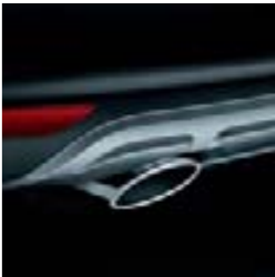
Stainless steel exhaust pipe end piece for 1.2 TSI (5L0 071 911)