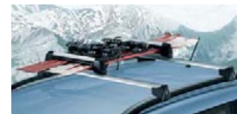
Lockable ski or snowboard rack with aluminium profile; capacity up to 4 pairs of skis or 2 snowboards (LBB 000 001) No photo: Lockable ski or snowboard rack with metal profile (LBT 071 027)