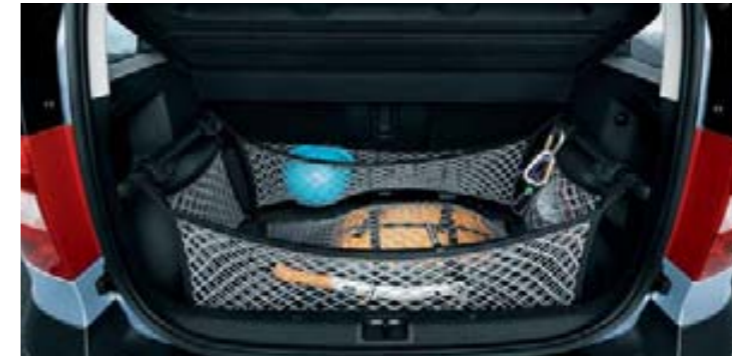
Netting system; silver colour design; 5-piece set for floor without spare wheel (DMA 630 003); for false boot floor (DMA 630 002); 4-piece set for floor with spare wheel (DMA 630 001)