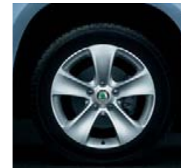
Alloy wheel 7.0J x 16" Moon for tyre 215/60 R16 (CCR 800 005)