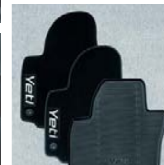
Foot mats; 4-piece sets rubber (DCC 630 001); Prestige textile (DCA 630 001); Standard textile (DCA 630 002)