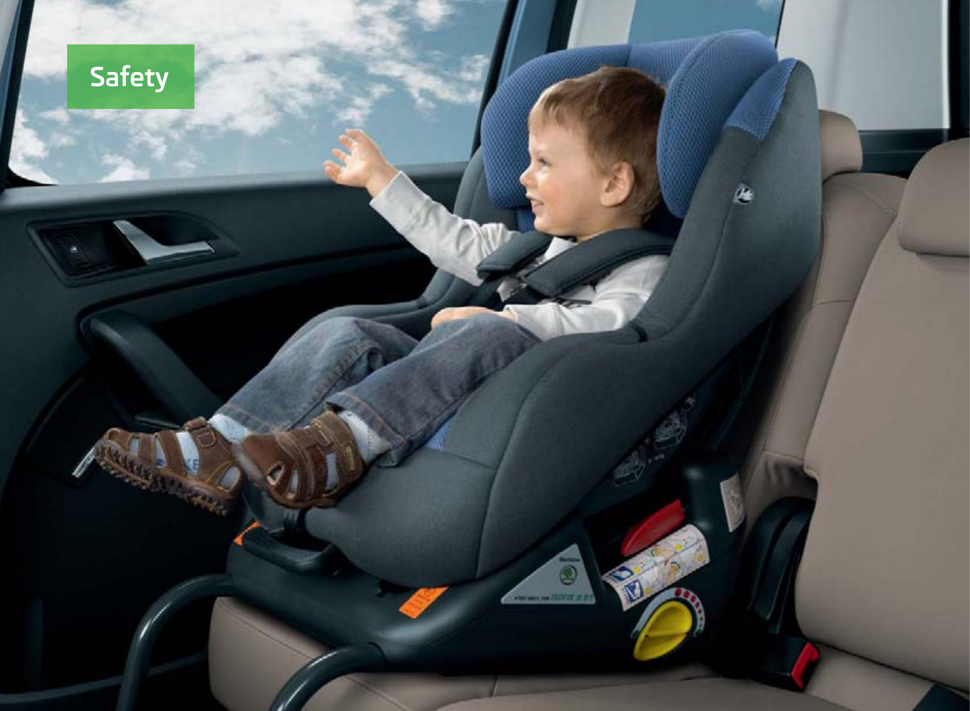
Baby One Plus child seat (5LO 019 900)