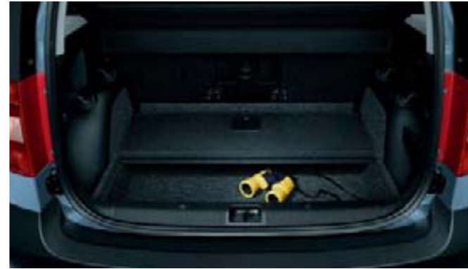
False boot floor (DAA 630 001)