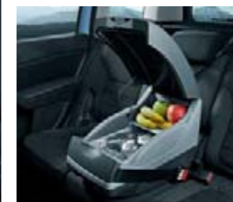
Thermo-electric cooling box; 15-litre capacity (5L0 065 400)