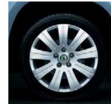
Alloy wheel 6.0J x 17" Flash for tyre 205/50 R17 (CCX 800 003); suitable for snow chains (CEP 800 001)