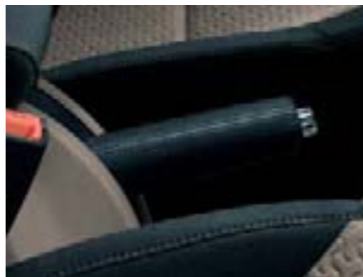
Leather handbrake lever for cars with Jumbo Box (FFA 600 011) No photo: for cars without Jumbo Box (FFA 600 010)