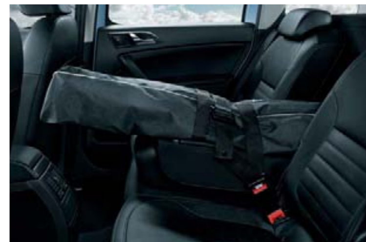
Ski sack for 2 pairs of skis (DMA 630 004)