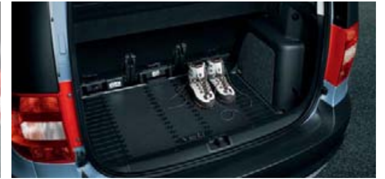
Plastic boot dish with raised 15cm edge for all types of boot (DCE 630 001)