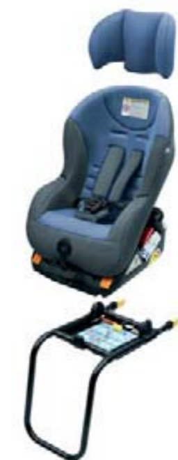
Wavo 1-2-3 child seat (5LO 019 900B)