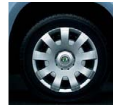
Hub cover Rif for wheel 7.0J x 16"; 4-piece set (CDB 800 001)