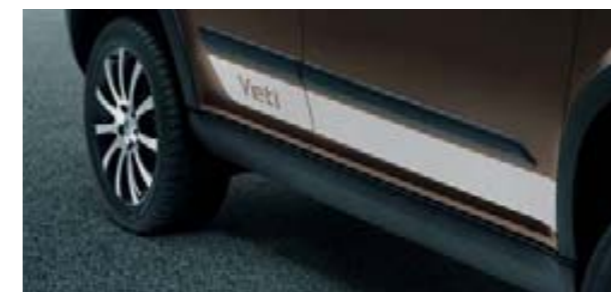
Side door foil; light version (5LO 071 733C)