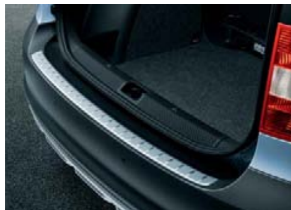
Protective cover of the rear bumper; ALU look (5L0 071 360)