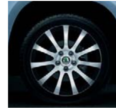
Alloy wheel 7.0J x 17" Annapurna for tyre 225/50 R17; silver/black design (CCH 630 005)