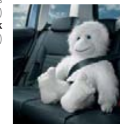
Cuddly Yeti toy (5L0 099 301)