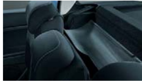
Boot cover behind rear seats to block the view of the luggage compartment (DMK 630 001)