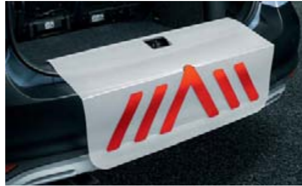
Rear bumper cover foil (KDX 630 001)