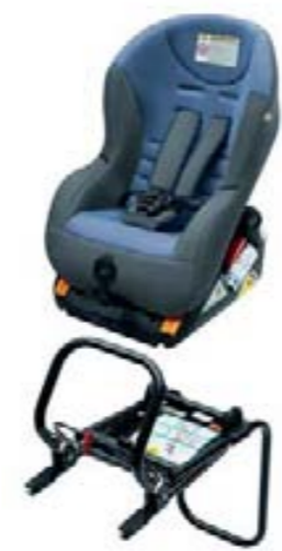
ISOFIX G 0/1 child seat (5LO 019 905) with FWF frame for forward-facing fitting (5LO 019 902) and headrest (5LO 019 903)