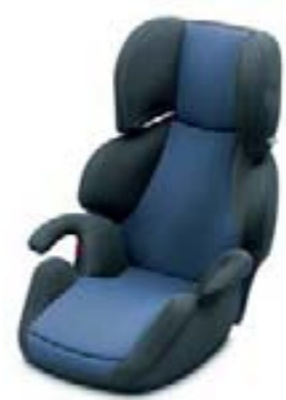
Wavo Kind child seat (5LO 019 900C)