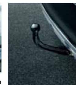
Detachable tow bar (EEA 630 001A) Electrics with 13-pole socket for cars without serial preparation for the tow bar (EEA 630 001E4); for cars with serial preparation for the tow bar (EEA 630 002E4) Adapter with 7-pole socket for trailer connection (EAZ 000 001A) Safety lug of the tow bar for the trailer (5L0 056 705)