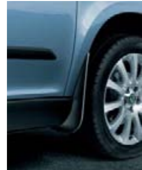
Front mud flaps (KEA 630 001)