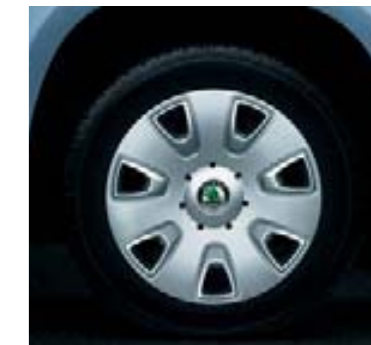
Hub cover Cold for wheel 6.0J x 16"; 4-piece set (CDB 630 001)