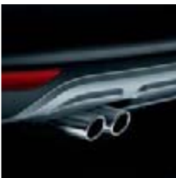
Stainless steel exhaust pipe end piece for 1.4 TSI and 2.0 TDI CR 81 kW/103 kW (5L0 071 910)