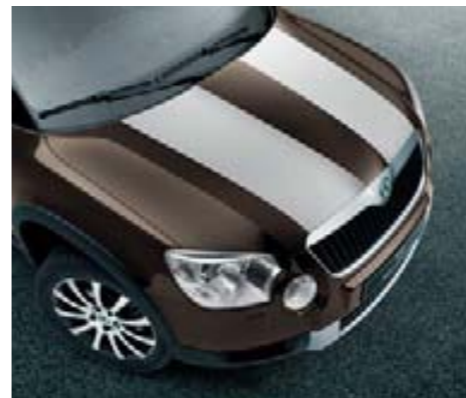
Bonnet foil; light version (5LO 071 733B)