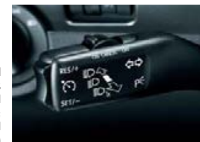
Cruise control for all engine versions for cars with on-board computer (3T0 035 623); for cars without on-board computer (3T0 035 623A)