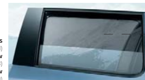
Rear side window sunblinds (5L0 064 361) No photo: Boot side window sunblinds (5L0 064 363) 5th door window sunblind (5L0 019 120)