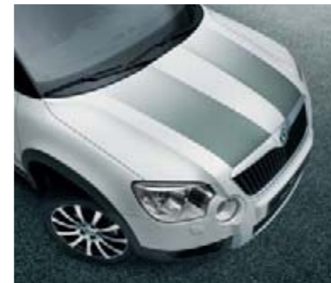
Bonnet foil; dark version (5LO 071 733)