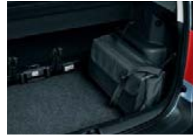
Boot bag (DMK 770 003)