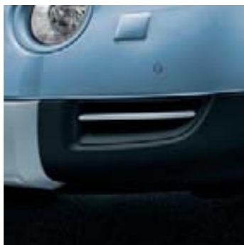
Slats of the front bumper; ALU look (5L0 071 329)