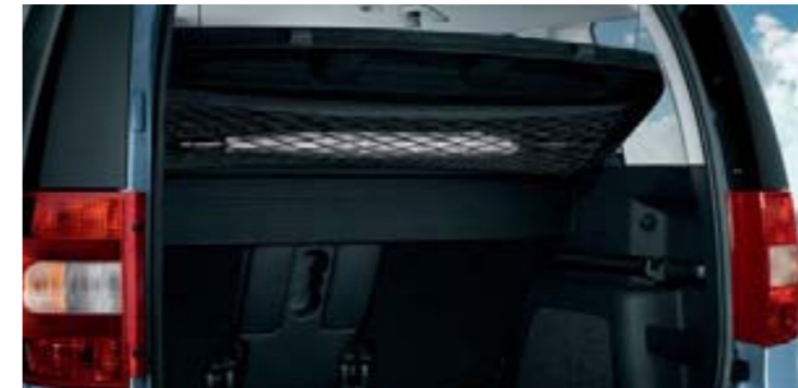
Net under the parcel shelf (DMK 630 002)