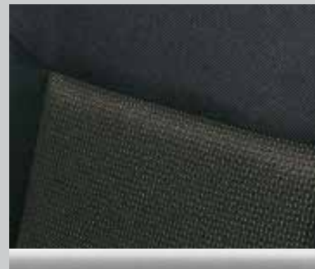
▲ Alpha/Elba Charcoal. Décor moulding: Matt Chrome.

● = available – = not available 1 Optional.