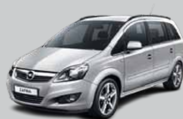
▲ Sovereign Silver