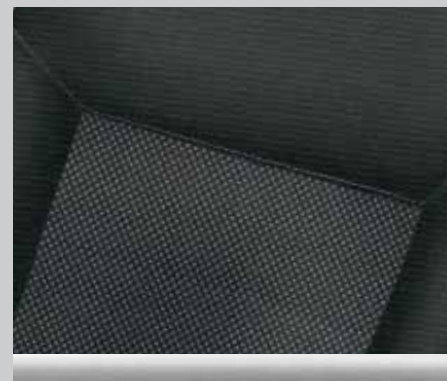
▲ Twist/Elba Charcoal. Décor moulding: Matt Chrome.