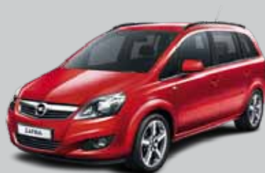
▲ Power Red