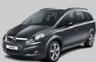
▲ Technical Grey