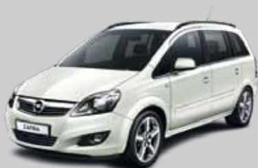
▲ Olympic White