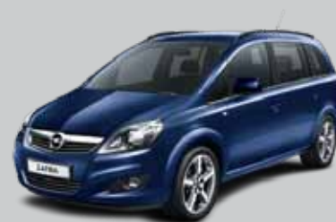
▲ Royal Blue

Let your Opel Zafira reflect your personality. Choose from a range of solid, brilliant, metallic, and pearl-effect paint colours.