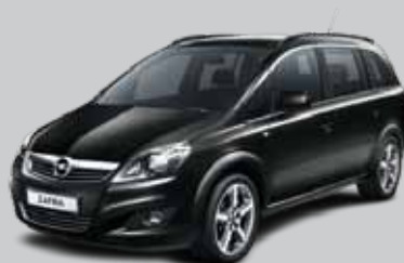
▲ Carbon Flash