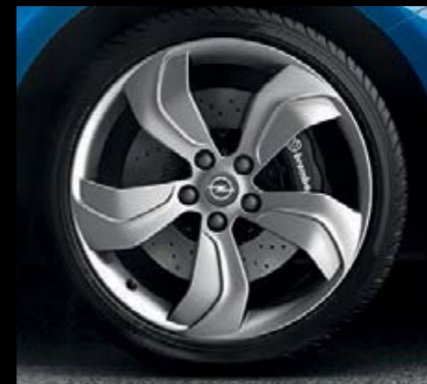
Alloy wheel. 8J x 19", OPC, tyres 245/40 R19 (RQN, standard).