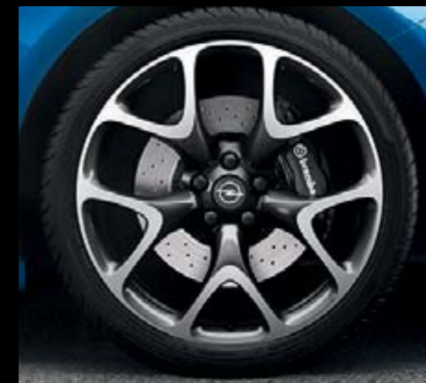
Alloy wheel. 8,5J x 20", OPC, weight-optimized, tyres 245/35 R20 (R01, optional).