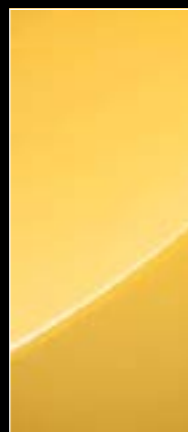
Flaming Yellow 1