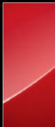
Power Red 1