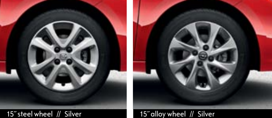
15" steel wheel // Silver