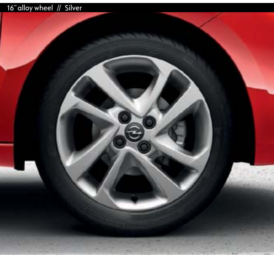
16" alloy wheel // Silver