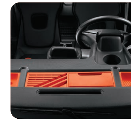
Dashboard storage boxes