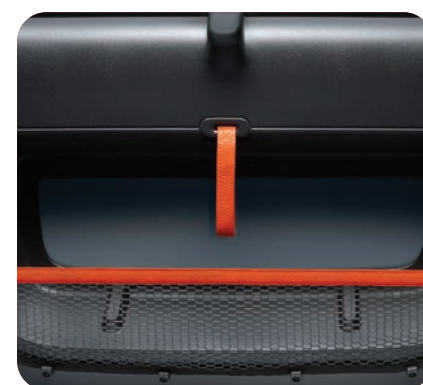
Black door nets with a horizontal band