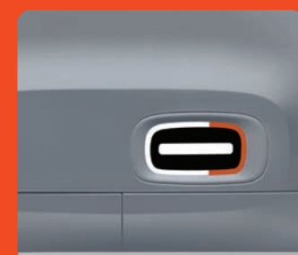
Lower door decals