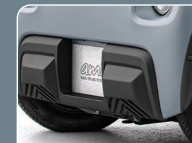
Black lower front bumper