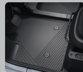
Black floor mats with colour-coded trim