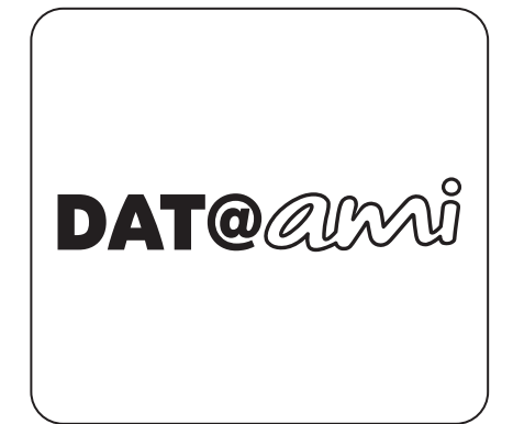
DAT@AMI for connecting your smartphone to Ami