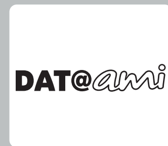
DAT@AMI for connecting your smartphone to Ami