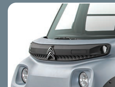
Black embellisher at top of front bumper