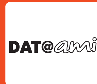
DAT@AMI for connecting your smartphone to Ami