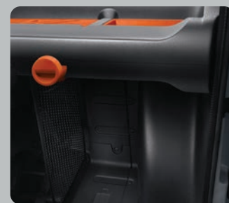
Black central separation net