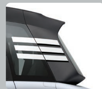
Rear window decals