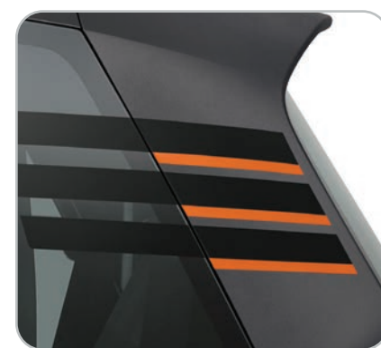
Rear window decals