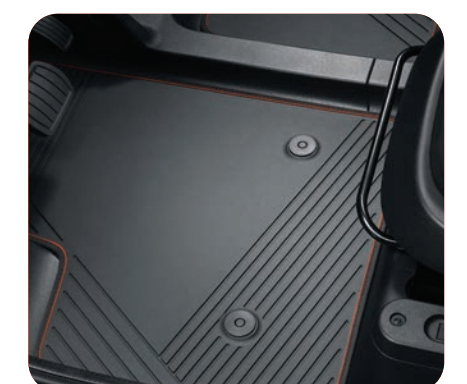
Black floor mats with colour-coded trim