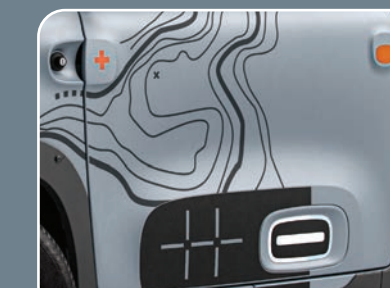
Side decals with "contour lines" design