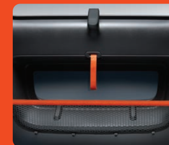
Black door nets with a horizontal band