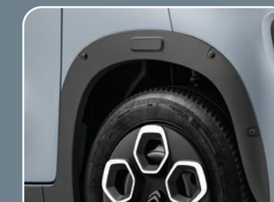
Black wheel arch surrounds