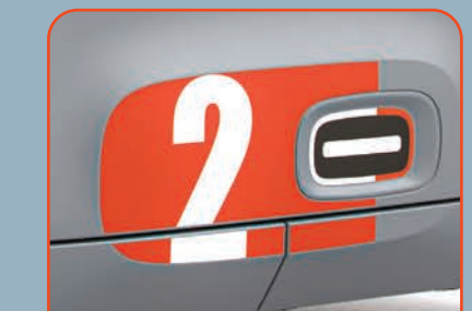
Orange lower door decals