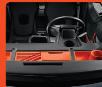
Dashboard storage boxes