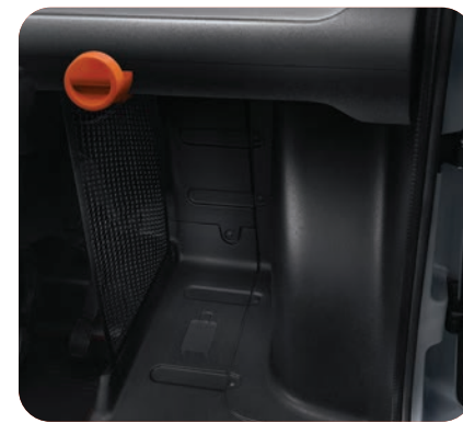
Black central separation net