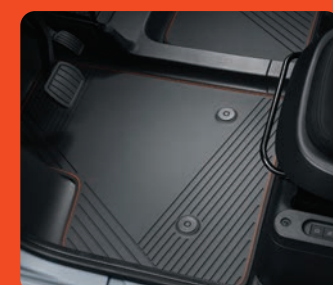
Black floor mats with colour-coded trim