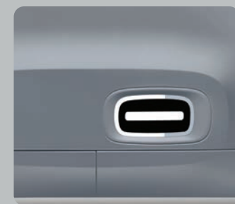
Lower door decals