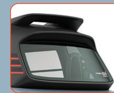
Black spoiler at the rear of the roof