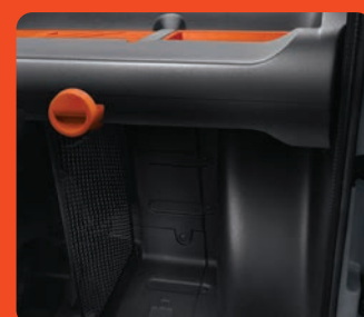
Black central separation net