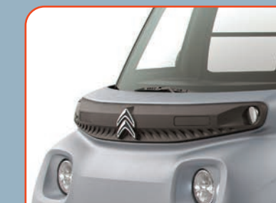
Black embellisher at top of front bumper