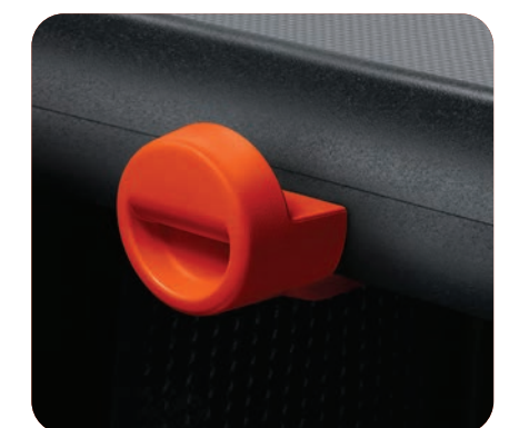
Dashboard bag hook on passenger side