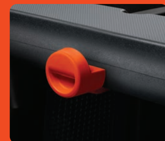
Dashboard bag hook on passenger side