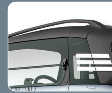
Black decorative roof rails