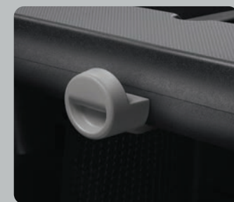
Dashboard bag hook on passenger side