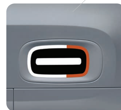
Lower door decals