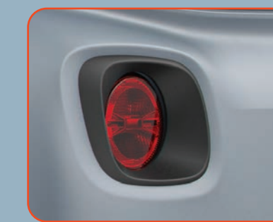
Black surrounds for rear lights