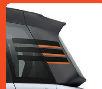
Rear window decals