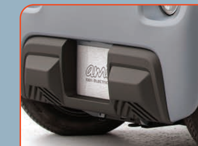
Black lower front bumper