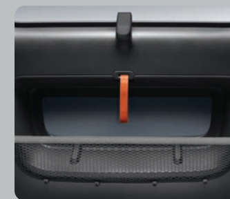
Black door nets with a horizontal band