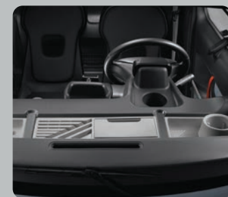
Dashboard storage boxes