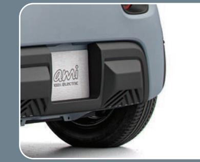
Black lower rear bumper