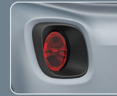
Black surrounds for rear lights