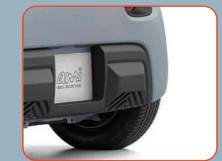
Black lower rear bumper