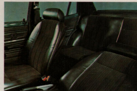
Luxurious interior of 4-door saloon.