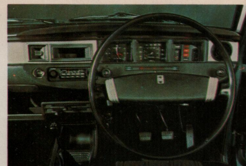
Comprehensive fascia of 4-door saloon.