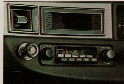
Two wave-band push-button radio.