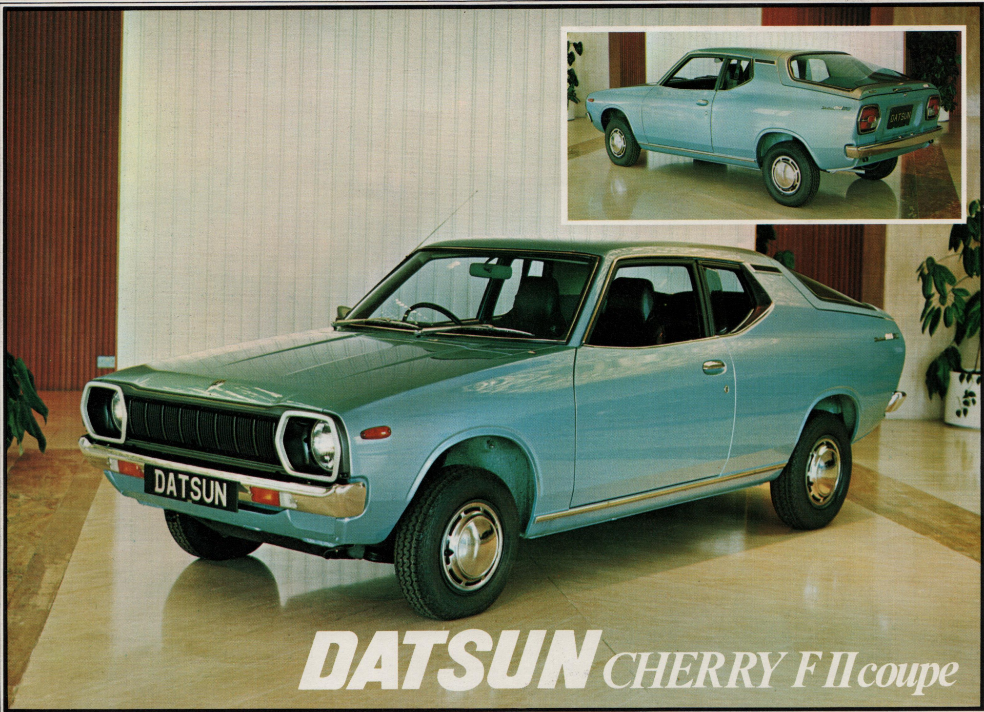
DATSUN CHERRY F II coupe