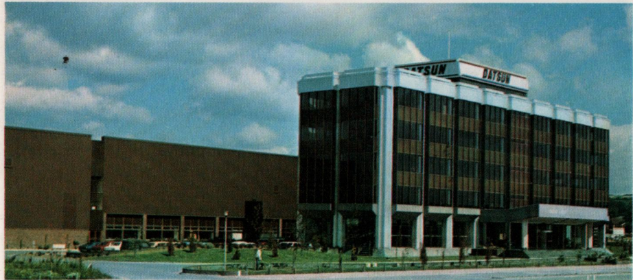
DATSUN U.K. HEADQUARTERS AT WORTHING, SUSSEX.