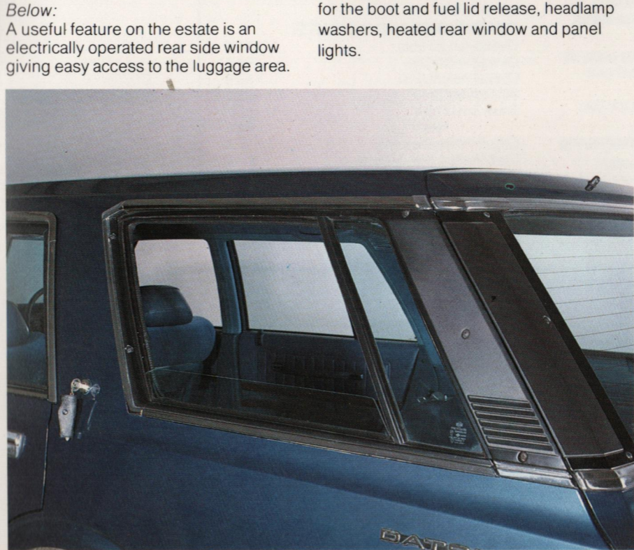
Below Right: Facia panel on the saloon houses controls for the boot and fuel lid release, headlamp washers, heated rear window and panel lights.