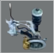
All-round disc brakes with ABS and traction control are standard