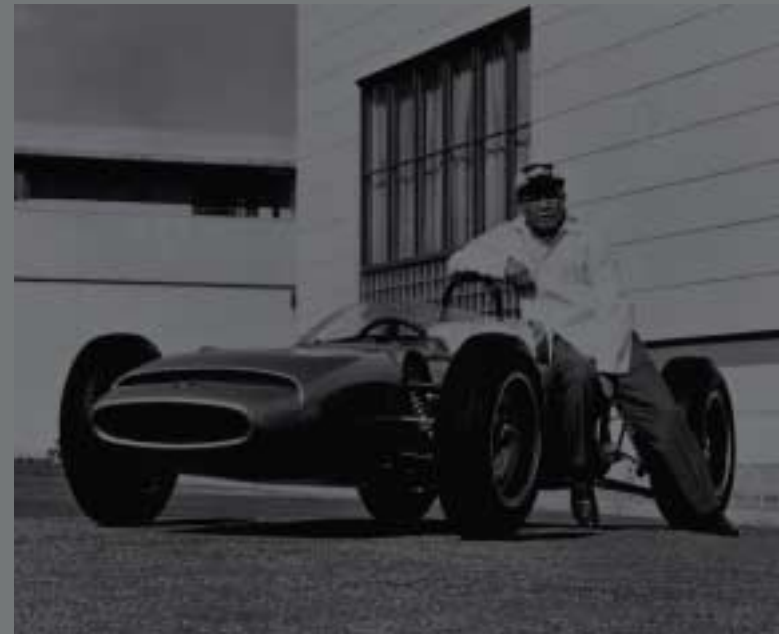
Soichiro Honda founded his company on a lifelong passion for racing

The NSX is the car our engineers always wanted to design. An ultra-lightweight aluminium body and chassis, with a choice of compact 3.0 and 3.2 litre V6 engines, achieve their ambitious targets for power-to-weight ratio and top speed. But the NSX overturns conventional thinking in one crucial respect: it's a genuine supercar that all drivers can enjoy – utterly satisfying, yet never intimidating, with light, easy controls and confident handling right out on the limits. It's the mid-engined two-seater you can use every day. A dream car for the real world.