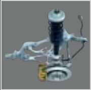
Independent double-wishbone suspension configuration comes straight from F1