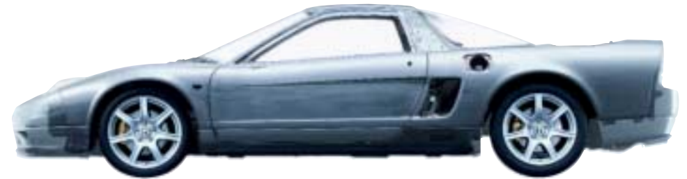
Ayrton Senna, a fundamental member of the NSX development team, called it 'the sports car anyone can drive'. We couldn't have put it better ourselves.

And the sound? Until they put a back seat in an F1 car, you won't hear anything else like it. Did you think we'd be happy with anything less?