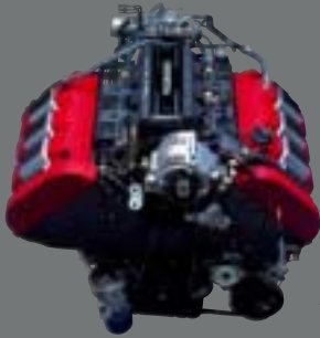
The heart of the NSX: the hand-built, all-aluminium V6 VTEC