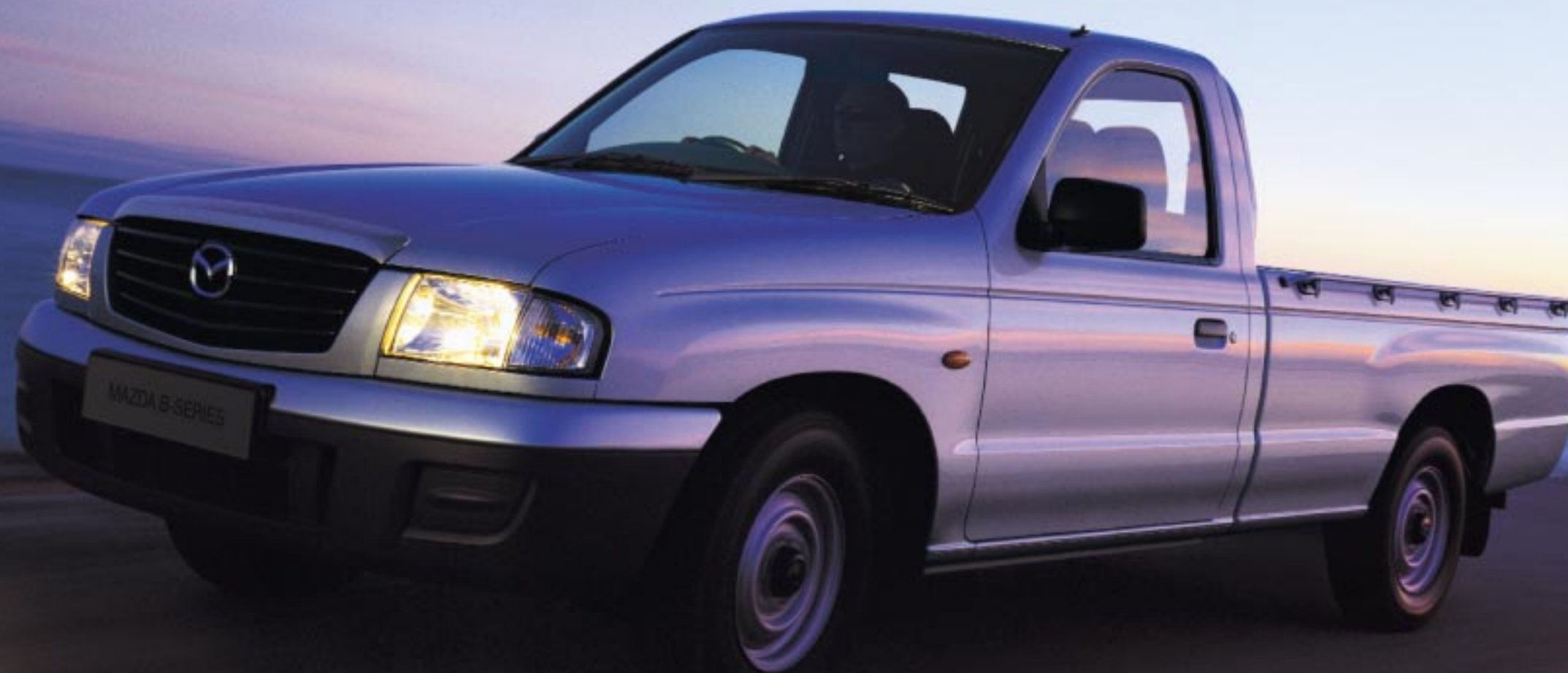
Vehicle shown 4x4 Single Cab.