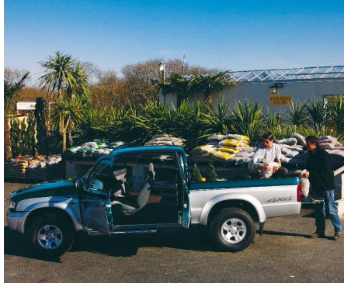
Vehicle shown 4x4 RAP Cab 4-Action.

Confident and purposeful, the exterior of the new Mazda B-Series has a powerful on-road presence. It's a real sit-up-and-take-notice kind of pick-up, but with a car-like ambience. From the unmistakable Mazda five-point grille to the newly designed multi-reflector headlamps, dynamic wheel arches and rear mudguards to the large chunky tyres; which not only help to give Mazda B-Series its rugged appearance, but also increase ground clearance and improve off-road comfort. And then there's thoughtful touches like chrome door mirrors and outer door handles, sporty alloys and stylish side-steps. Also, on the 4x4 RAP Cab 4-Action, the innovative design includes reverse-hinged rear doors and front-hinged front doors without a central pillar, which allows you and your passengers unrivalled access to the interior. All of which help to give Mazda B-Series its head-turning, fresh, dynamic appearance.