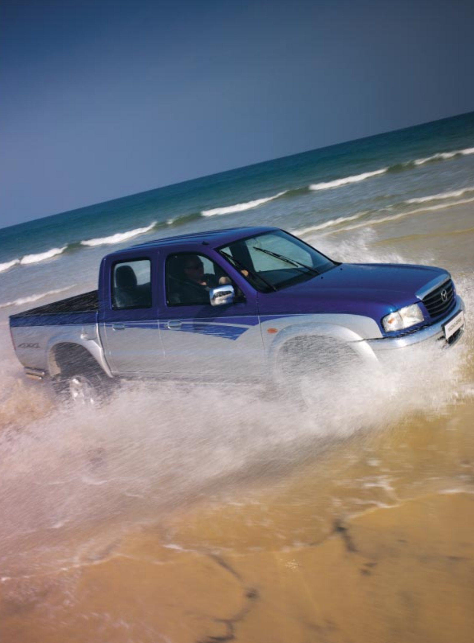
Front cover shows the 4x4 Double Cab 4-Style.