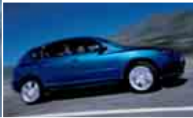
Image shows Mazda3 hatchback 2.0 Sport with optional navigation system.

Both the front and rear suspension systems provide superior balance for increased handling stability and ride comfort. At the front, an innovative mounting system between the subframe and the body helps smooth away vibrations, noise and harshness to offer you the comfort of a larger car. Which, in combination with the multi-link rear suspension, creates a thrilling, yet controlled, driving experience for you to enjoy again and again.