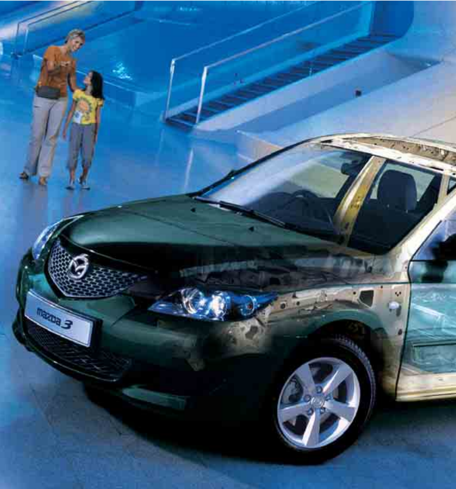
Image shows Mazda3 hatchback S with optional metallic paint.