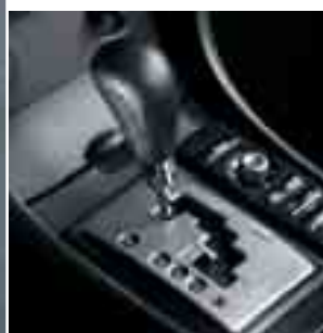
Image shows optional Activematic* transmission.

*Common-rail diesel and Activematic transmission not available until June 04.