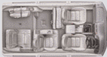
Rear seats split and folded.