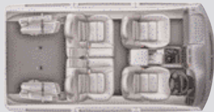
Third row seats folded away.

Electric windows and mirrors and dual front airbags are standard on all models, while the SVE grade features front side airbags, leather upholstery and climate control. In the back, the long wheelbase allows an extra row of seats and both the second and third row will split 50:50 and fold away. Whether it's seven people or an antique wardrobe, the Patrol GR's got room for it.