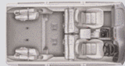
All rear seats folded.