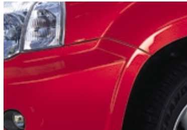
Chilli Pepper AX6 [S]