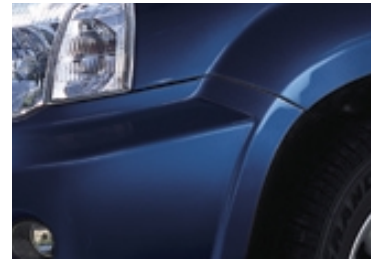
Aruba Blue BW6 [M] [P]