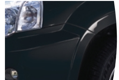
Kuro Black KH3 [S]