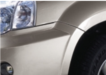
Zinc KX4 [M]