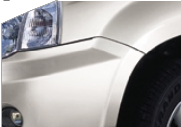
Blade Silver KYO [M]