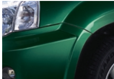
Amazon Green DW0 [M] [P]