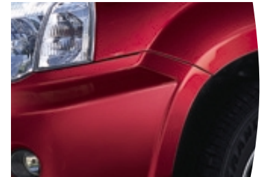
Merlot AX5 [M] [P]