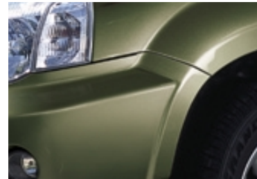
Verdale Green D13 [M]