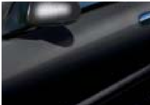
Pearl Black - Z11 M