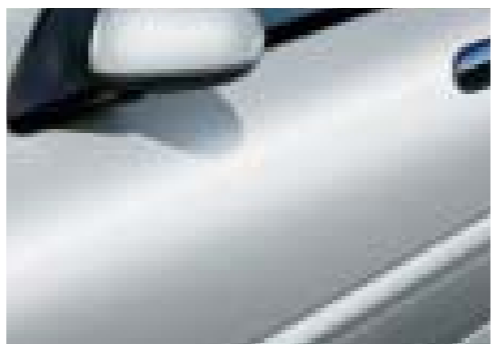
Blade - KY0 M