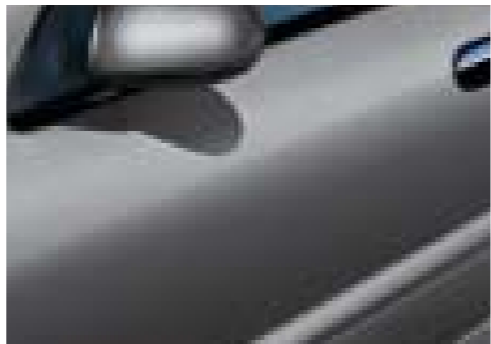
Techno Grey - KY5 M