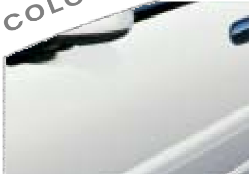
Arctic White - 326 S