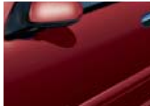
Merlot - AX5 P