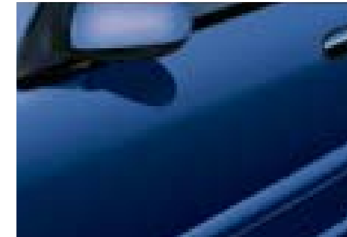
Cayman Blue - BW9 M