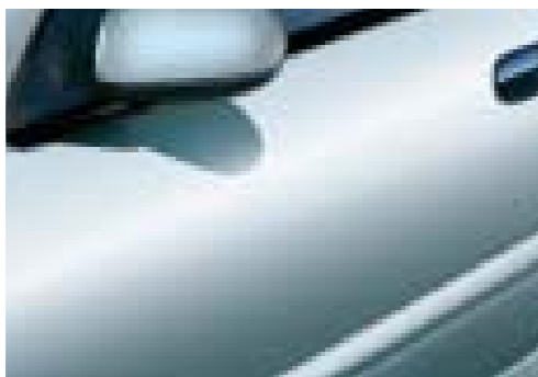
Ice - B22 M