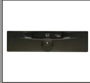
20 > 2nd DIN Cassette Player