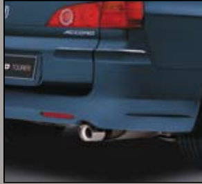
6 > Rear Bumper Trims