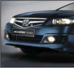
1 > Front Skirt