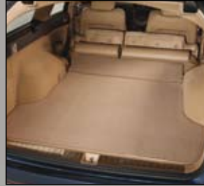
56 > Cargo Mat