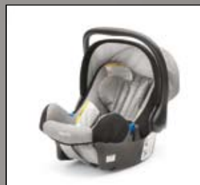
31 > Childseat Group 0+