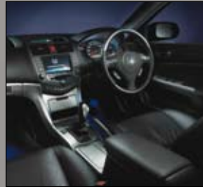
42 > Metal Look Interior Panel Kit