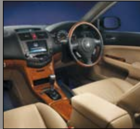
41 > Wood Look Interior Panel Kit