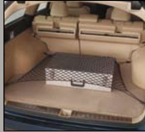
55 > Cargo Net