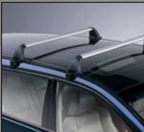
43 > Base Carrier