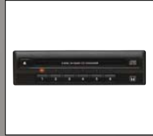
21 > 2nd DIN 6 CD Player