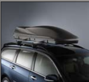
47 > Ski Box 320 L