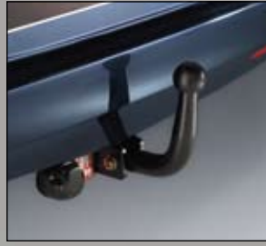
52 > Fixed Trailer Hitch (with Intelligent Trailer Harness)