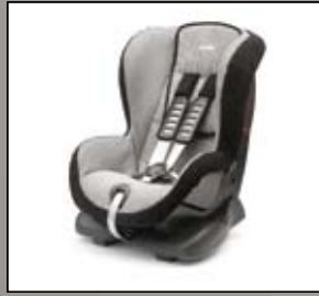
33 > Childseat Group 1+