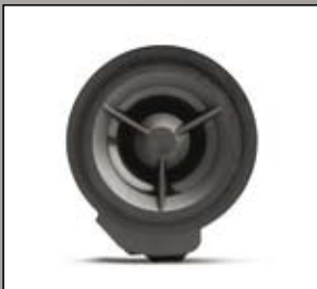
26 > Front Tweeter Kit