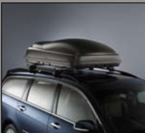
48 > Top Box 350 L