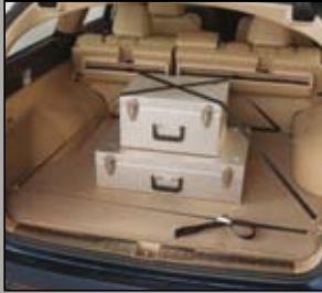
54 > Tie-Down Belt