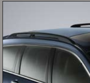
45 > Roof Rails (standard on all UK models)