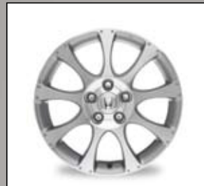
13 > 17" Alloy Wheel