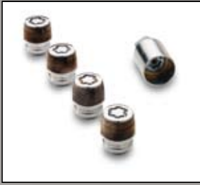
17 > Locking Wheel Nuts