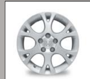
15 > 17" Alloy Wheel