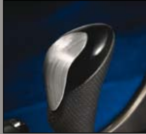
37 > Gearshift Knob 5MT