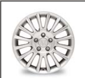
12 > 17" Alloy Wheel