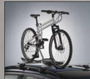
50 > Bicycle Attachment Easy-Fit