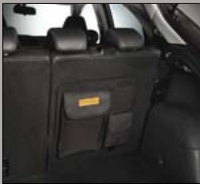
58 > Rear Seat Back Pocket