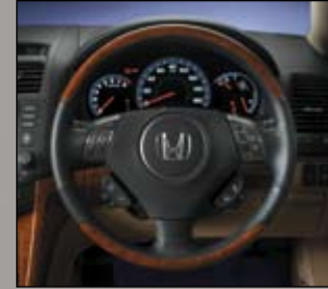
39 > Wood Look Leather Steering Wheel