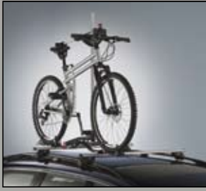
51 > Bicycle Lift