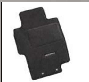
29 > Elegance Floor Carpets (Black)