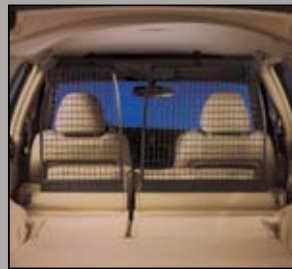
60 > Separation Net