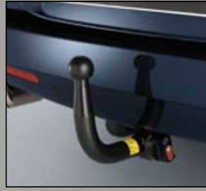
53 > Detachable Trailer Hitch (with Intelligent Trailer Harness)