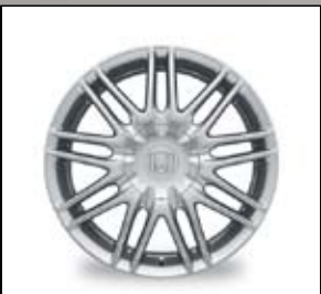
16 > 17" Alloy Wheel