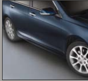
3 > Side Skirts