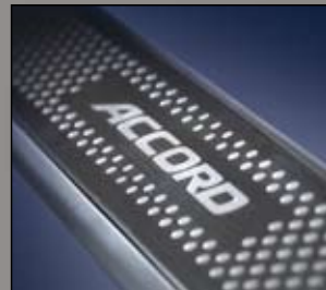
28 > Doorstep Garnish