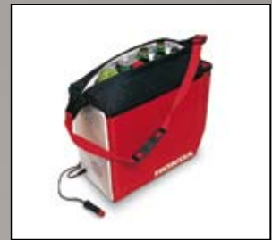
61 > Coolbox