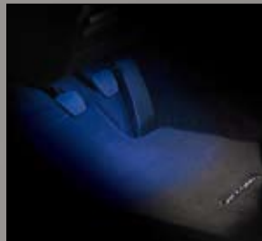
27 > Blue Ambient Lighting