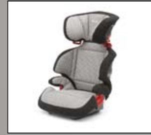
35 > Childseat Group 2 & 3