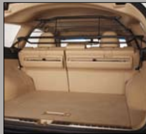
59 > Dog Guard