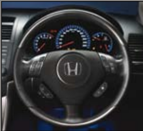
40 > Metal Look Leather Steering Wheel