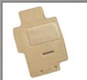
30 > Elegance Floor Carpets (Ivory)