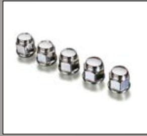
18 > Wheel Nuts (20 pc)