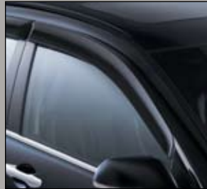
11 > Door Visors