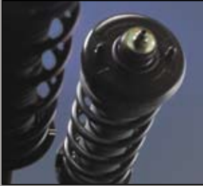
19 > Sports Suspension (available from mid-2006)