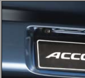
23 > Parking Aid Camera