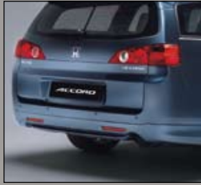
2 > Rear Skirt