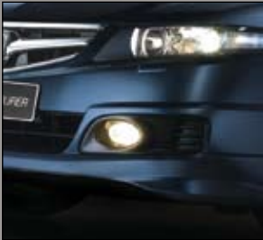
9 > Fog Lights