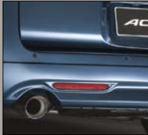
10 > Rear Parking Sensor