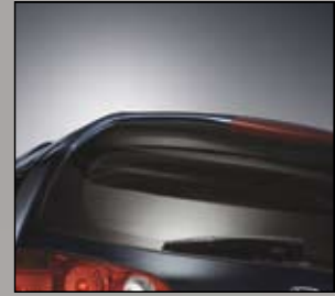
4 > Tailgate Spoiler