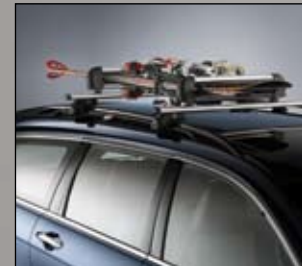
46 > Ski/Snowboard Attachment