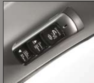
25 > Bluetooth® Phone System