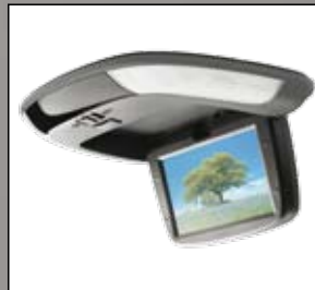
24 > I-VES (In-Vehicle Entertainment System)