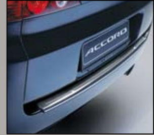
8 > Rear Bumper Protection