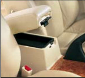
36 > Armrest cushion