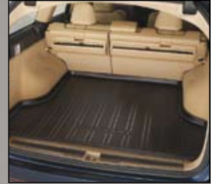
57 > Cargo Tray