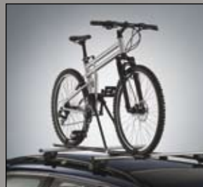
49 > Bicycle Attachment Classic