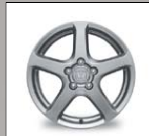
14 > 17" Alloy Wheel