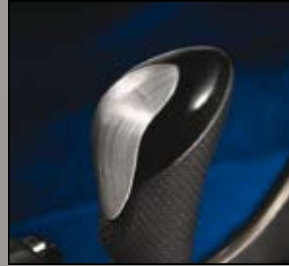
38 > Gearshift Knob 6MT