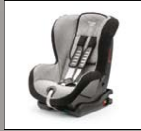
34 > Childseat Group 1+ Isofix