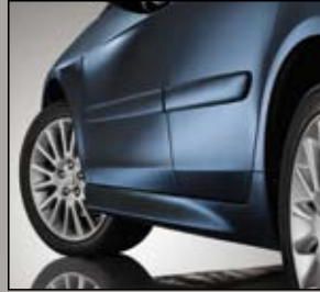
7 > Door Trims