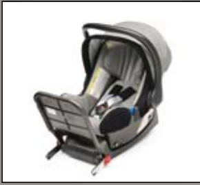
32 > Childseat Group 0+ Isofix