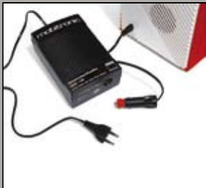
62 > Net Adapter for Coolbox