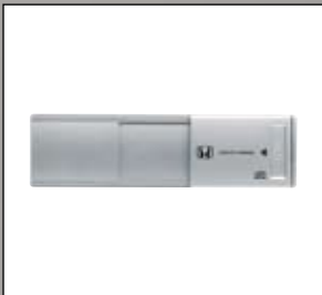
22 > 8 CD Changer