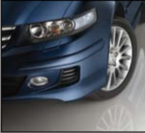
5 > Front Bumper Trims