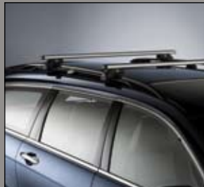
44 > Cross Bars