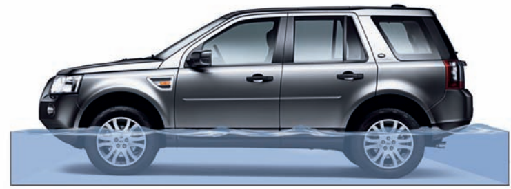
Wading Depth Maximum wading depth 500mm