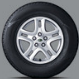
16 INCH, 5-SPLIT SPOKE ALLOYS – 215/75 AT