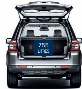
Maximum load space – seats up