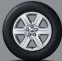
17 INCH, 6 SPOKE ALLOYS – 235/65 AT