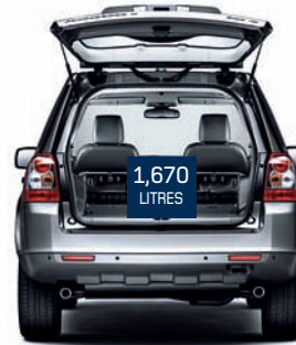
Maximum load space – seats down