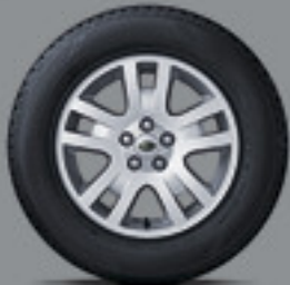
17 INCH, 5-SPLIT SPOKE ALLOYS – 235/65 AT