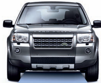
Obstacle Clearance Ground clearance up to 210mm Standard ride height 185mm