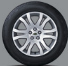
18 INCH, 12 SPOKE ALLOYS – 235/60 AT