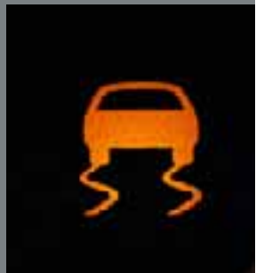
ABS and DSC The Anti-lock Braking System (ABS) with Electronic Brake-force Distribution (EBD) adjusts the braking force to suit the handling, while Dynamic Stability Control (DSC) responds to swerving tendency and stabilises the vehicle within milliseconds.