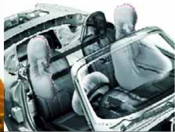
Airbag System Mazda MX-5 2.0 and 2.0 Sport models feature dual front and side airbags for optimum protection in the event of a collision.