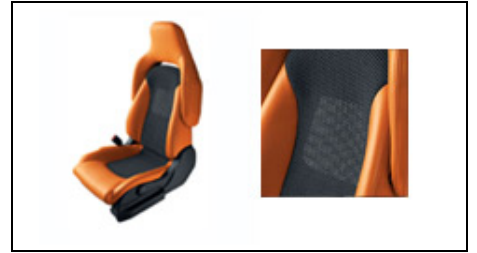
Alezan Orange Leather ventilated net seats, with gearshift and handbrake