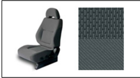
Cloth upholstery (Grey)