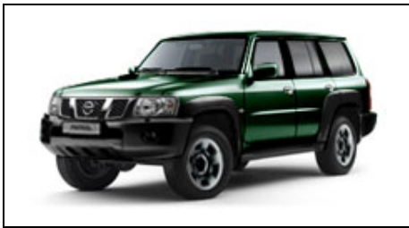
Amazon Green (P)