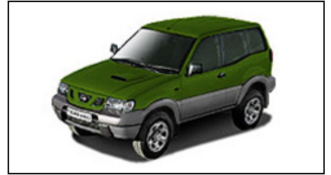
Two-tone Amazon Green / Techno Grey (M)