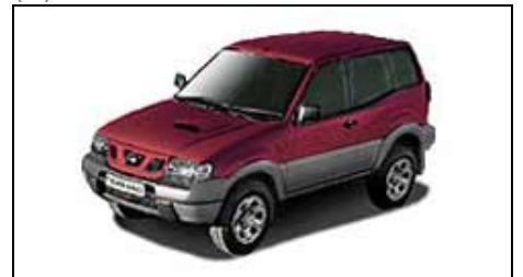
Two-tone Claret / Techno Grey