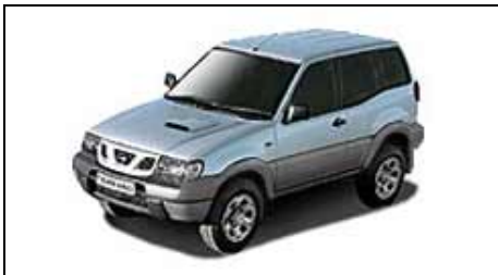
Two-tone Starburst Silver / Techno Grey