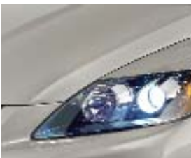
Platinum Silver Metallic (22R)