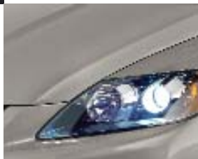
Moist Silver Metallic (30S)