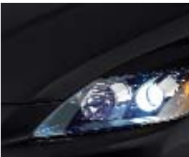
Brilliant Black (A3F)