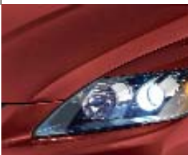
Copper Red Mica (32V)