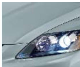
Icy Blue Metallic (33Y)