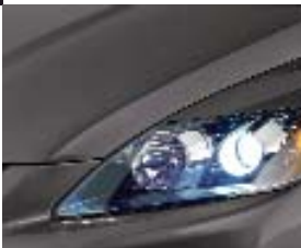
Galaxy Grey Mica (32S)