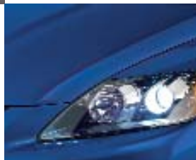
Aurora Blue Mica (34J)