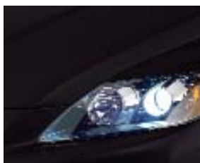
Radiant Ebony Mica (28W)