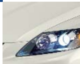
Crystal White Pearl Mica (34K)