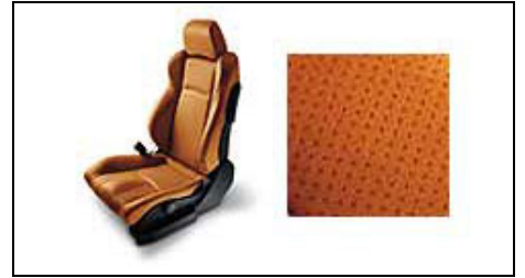
Alezan Orange Leather