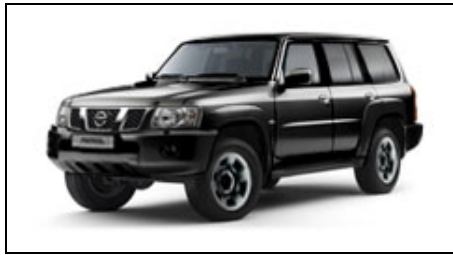
Kuro Black (S)