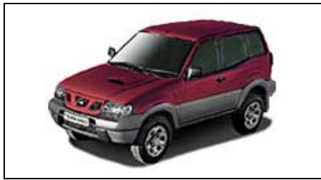
Two-tone Claret / Techno Grey