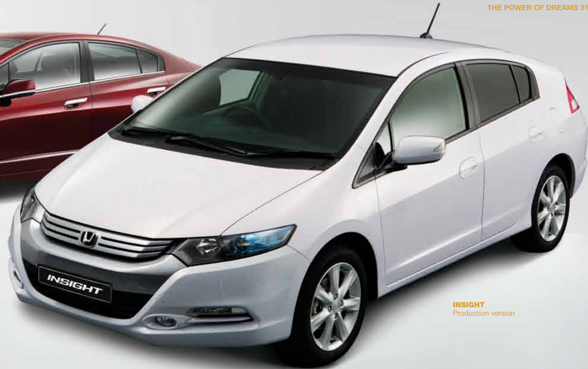
INSIGHT Production version