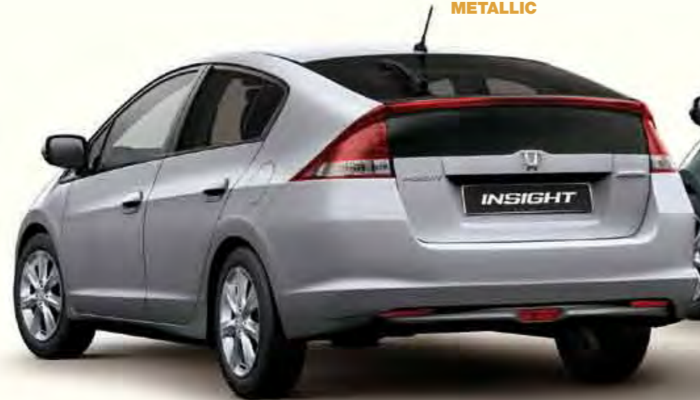
ALABASTER SILVER METALLIC