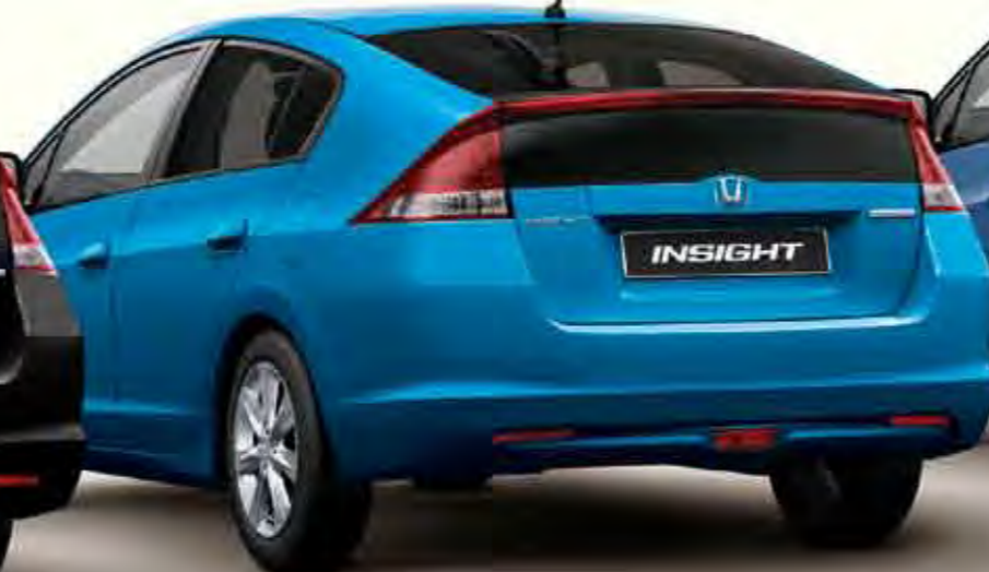
CERULEAN BLUE METALLIC