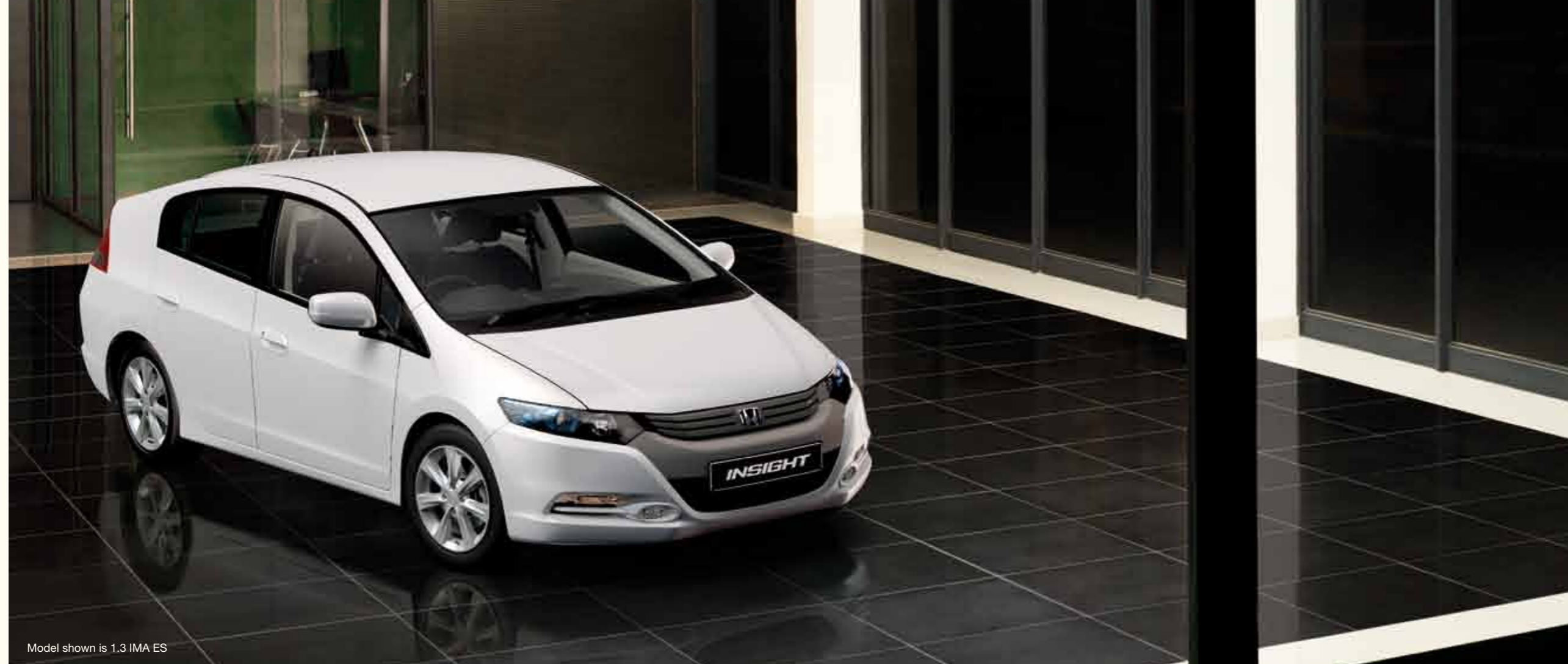
Model shown is 1.3 IMA ES

Being green is just one aspect of being good. But so are being safe, being smart and choosing the right technology.