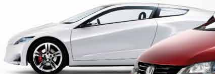
CONCEPT CR-Z Small Sports Hybrid