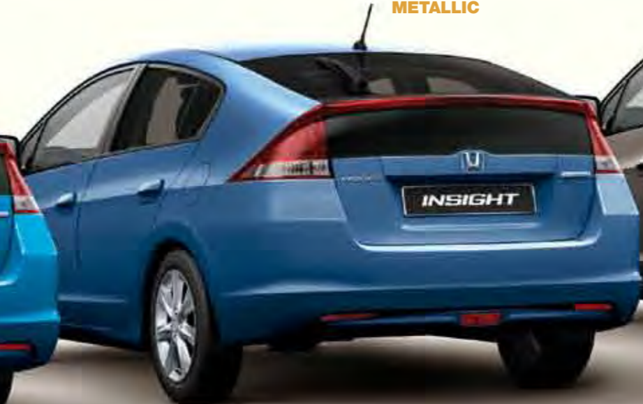
NEUTRON BLUE METALLIC