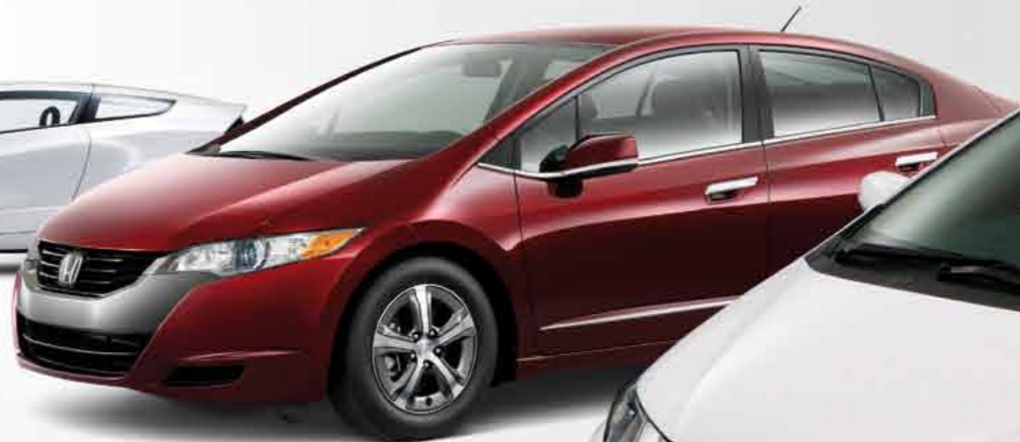
FCX CLARITY Zero emissions vehicle