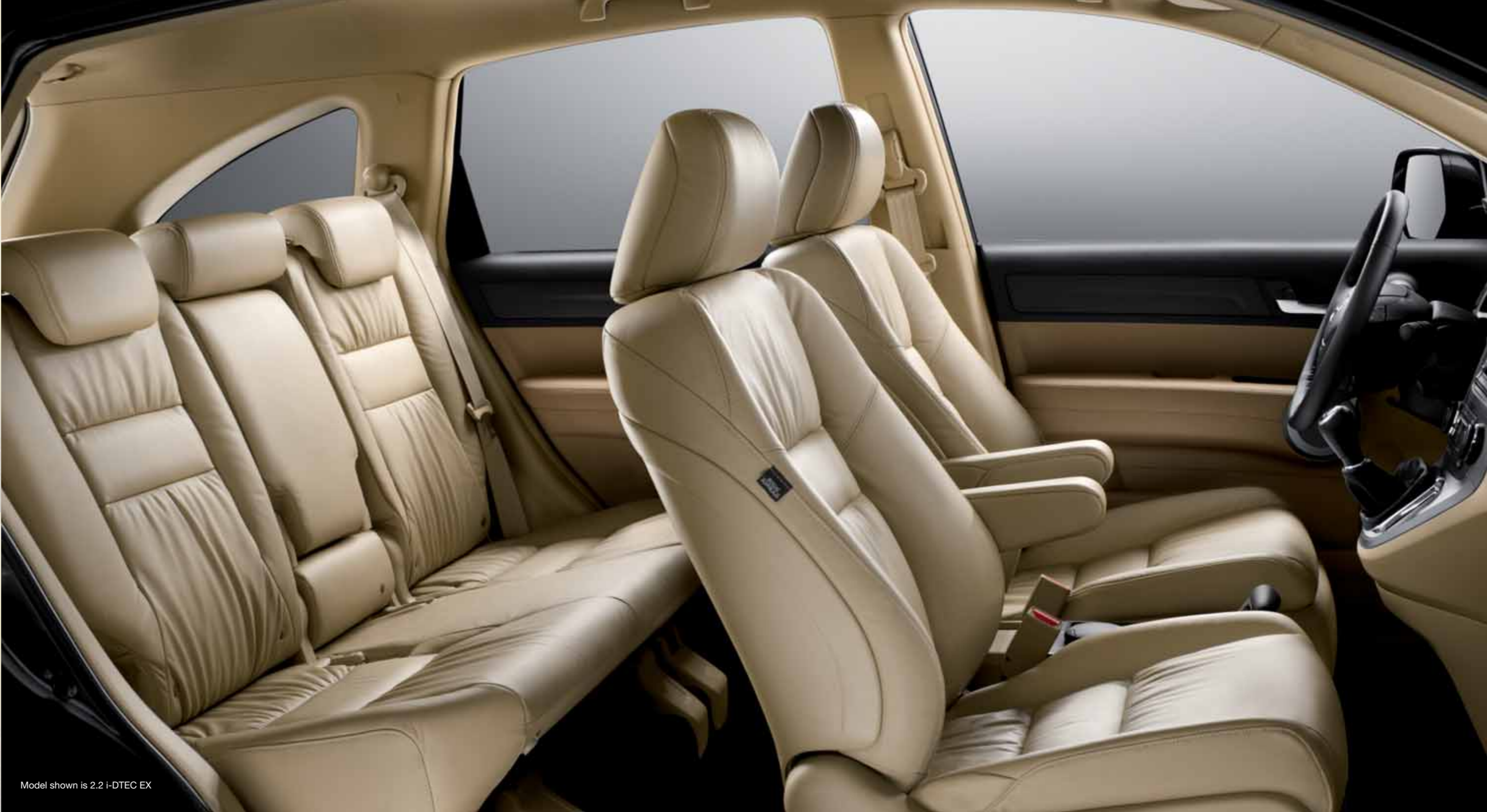
Model shown is 2.2 i-DTEC EX