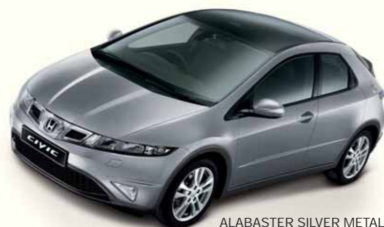
ALABASTER SILVER METALLIC