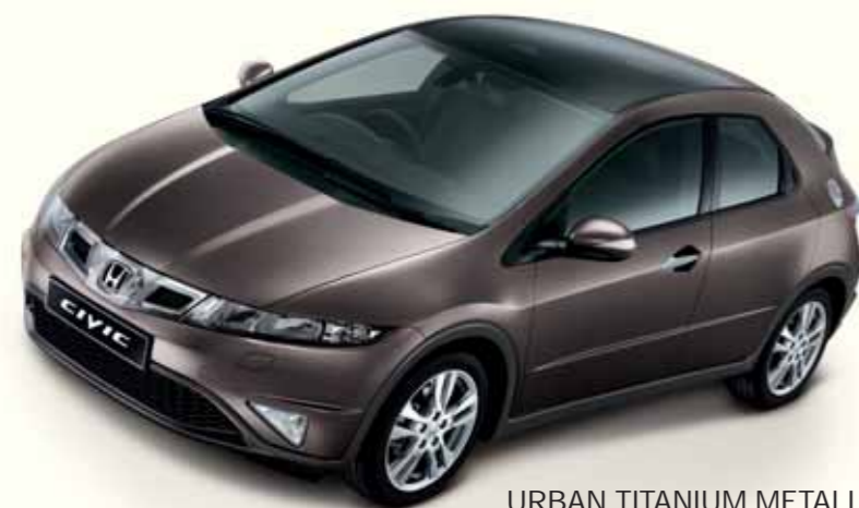
URBAN TITANIUM METALLIC