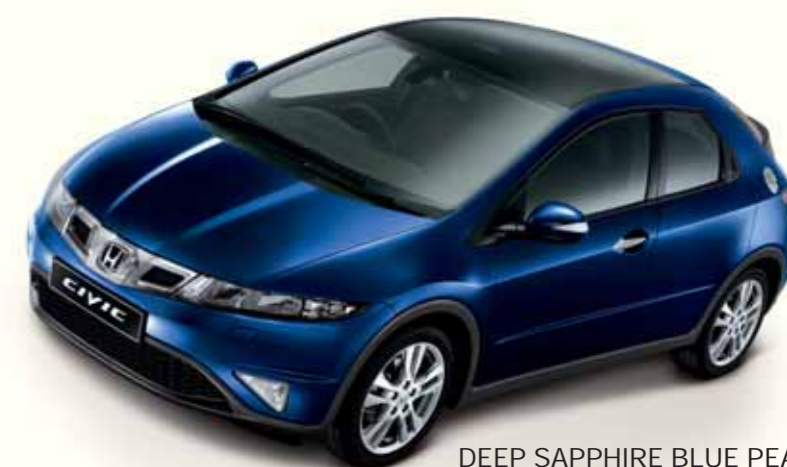
DEEP SAPPHIRE BLUE PEARL