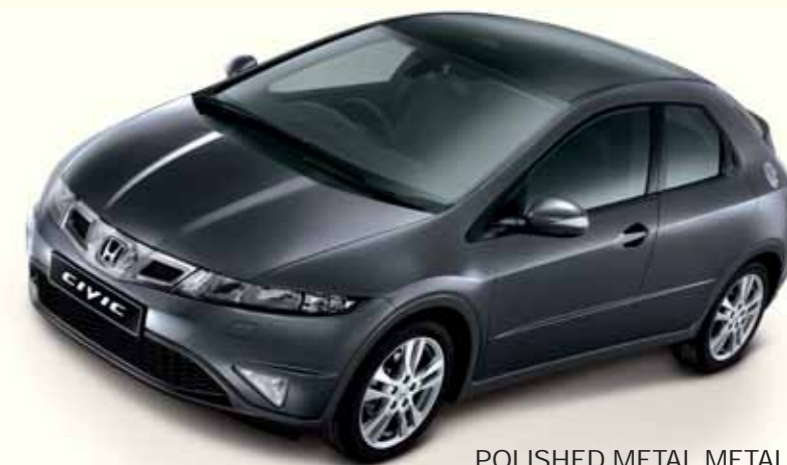
POLISHED METAL METALLIC