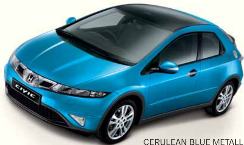
CERULEAN BLUE METALLIC

*Ivory leather is not available with Milano Red.