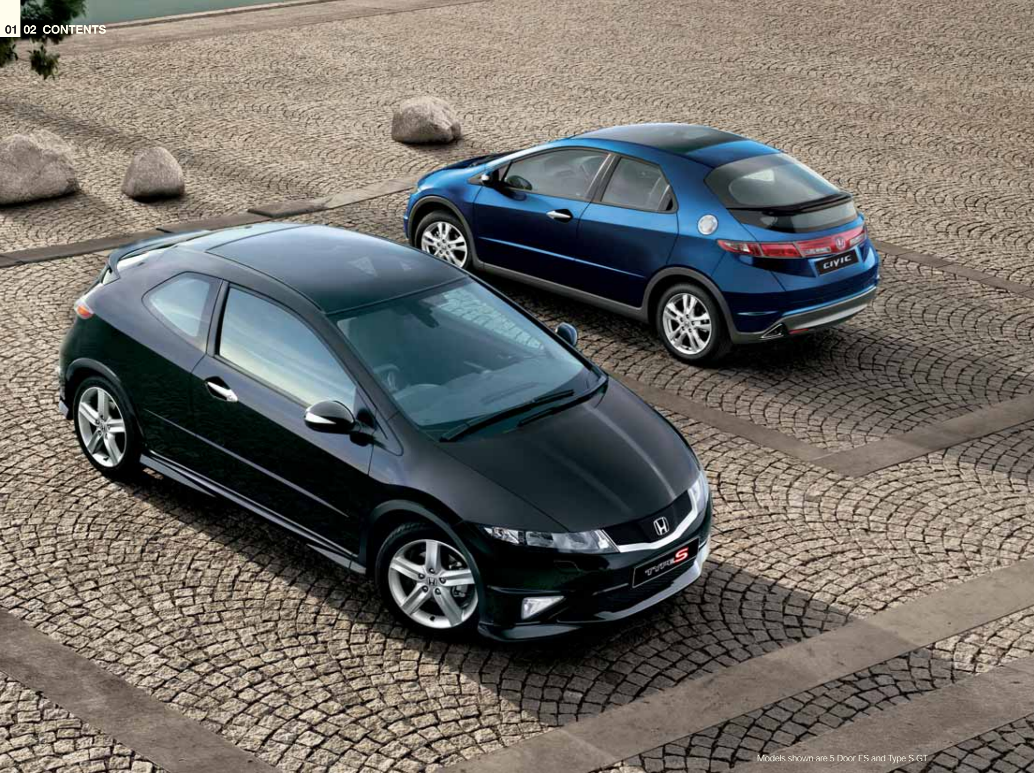
Models shown are 5 Door ES and Type S GT