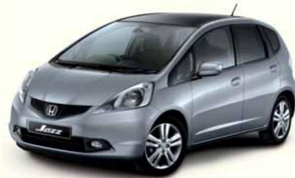
ALABASTER SILVER METALLIC