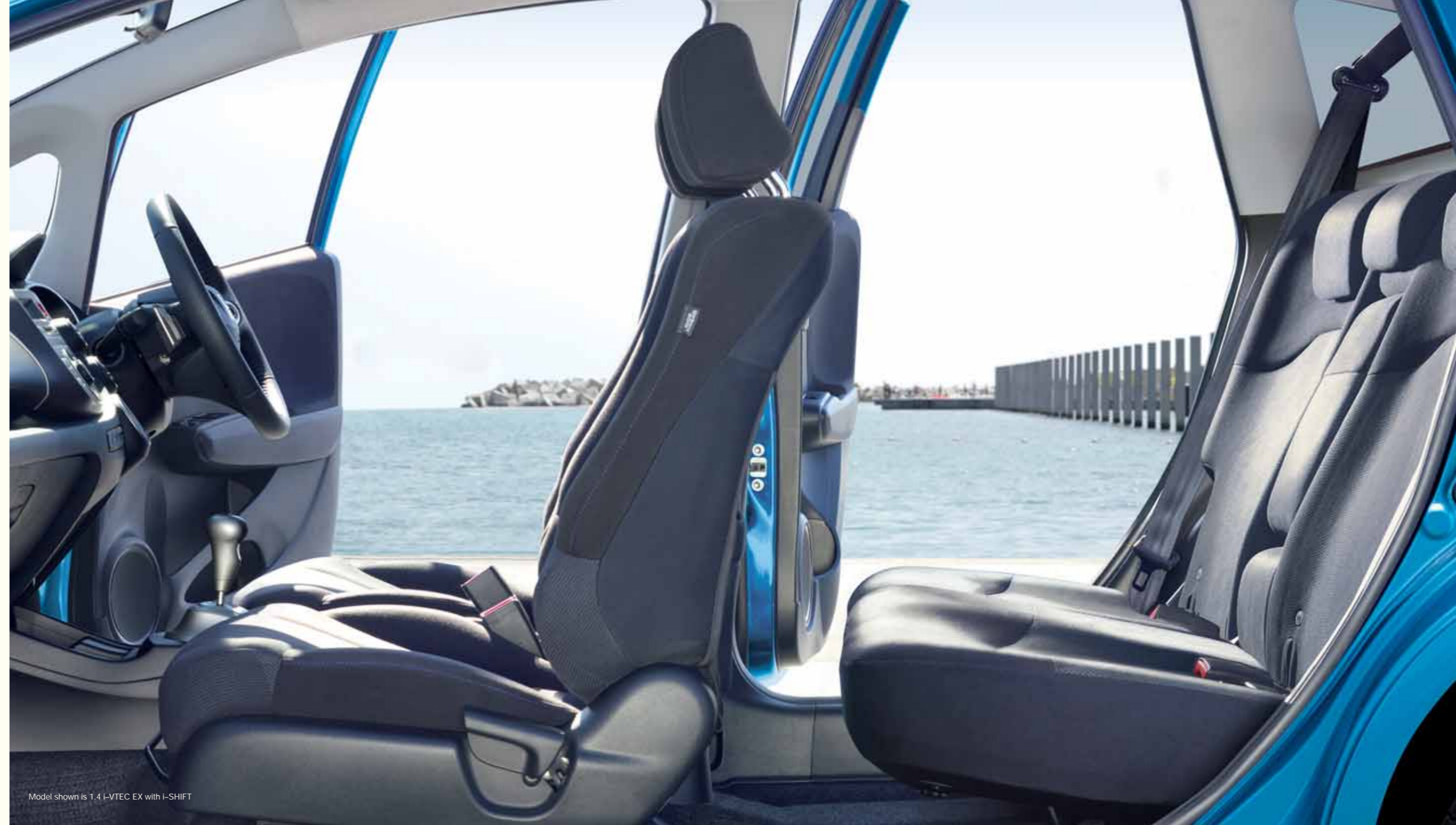
Model shown is 1.4 I-VTEC EX with I-SHIFT