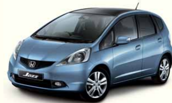
SHERBET BLUE METALLIC