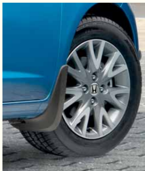
Shown with accessory 15" Crystal alloy wheels