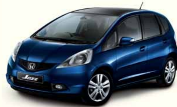
DEEP SAPPHIRE BLUE PEARL