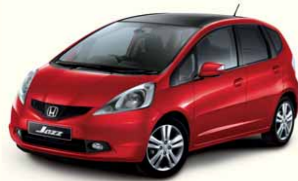
MILANO RED (SOLID)