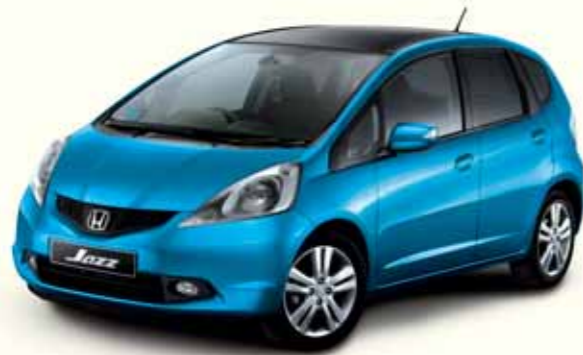
CERULEAN BLUE METALLIC