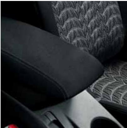
Leather armrest with stitch detailing.