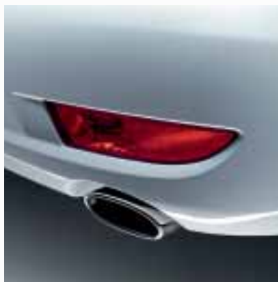
Bold stainless steel exhaust pipe.