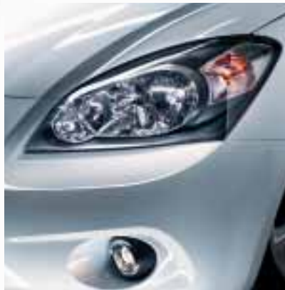
Black bezel headlamps.