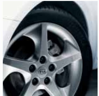
5-spoke 17" alloy wheel (standard on '3' grade).