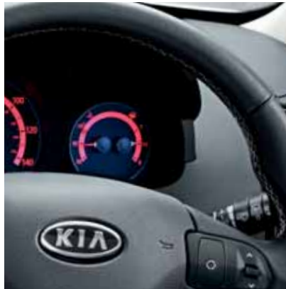
Leather steering wheel.

If you prefer, ask your Kia dealer for details about leather finish accessories available on the pro_ceed range.