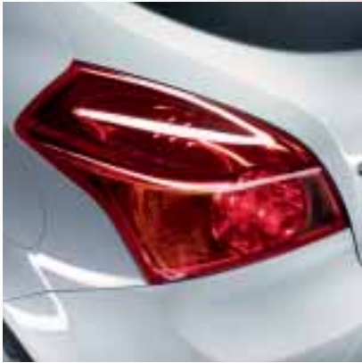
Multi-dimensional rear lights.

The Kia pro_ceed is a star in its own right. Elongated doors and a strong shoulder-line accentuate the dynamic wedge-shape profile. But there are more distinctive features to discover: the sports grille, the wide bumper and stylish spoiler on the rear roof line, black bezel headlamps, striking rear light clusters and the finishing touch - a bold stainless steel exhaust pipe, creating a bold yet agile look.