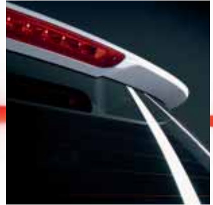
Rear spoiler with integrated brake light.