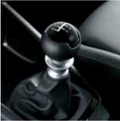
Sporty gearshift lever.