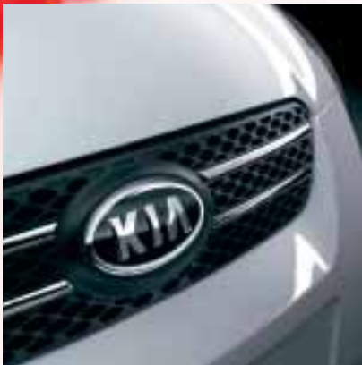
Striking sports pro_ceed grille.