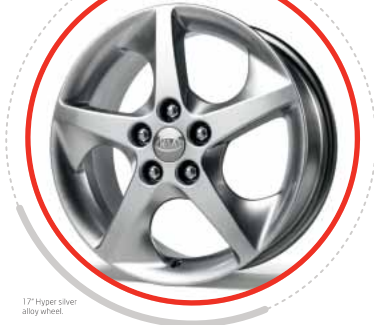
17" Hyper silver alloy wheel.

If you would like to boost the sporting prowess of the pro_cee'd, opt for the specially designed and top-of-the-range pro_cee'd '3' which is fitted with a set of stylish 17" Hyper silver alloy wheels. Inside, the sporty theme continues – with leather-clad steering wheel, gearshift and parking lever. The seats feature a contemporary tyre-track pattern fabric. The stitched finishing touches are repeated on the steering wheel and centre armrest console. Stainless steel signature door-scuff plates, alloy pedals and black gloss details throughout the cabin complete the sporty feel.