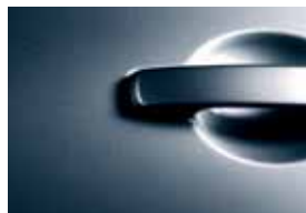
Cayman Blue /M BW9