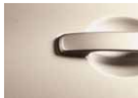
Café Latte /M C30