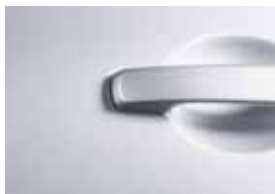
NEW Mineral Grey /M KAQ