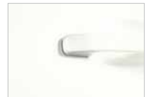
Arctic White /S 326