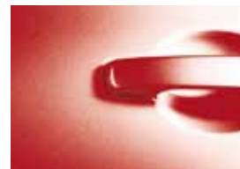
Flame Red /S Z10