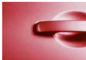
NEW Magnetic Red /M NAJ