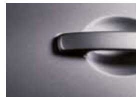
Nightshade /M GAB