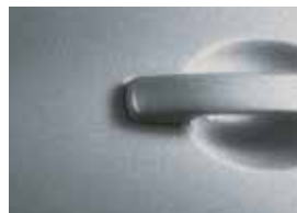
Faded Denim /M B52