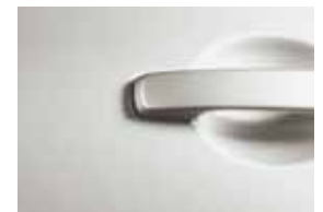
Blade Silver /M KY0